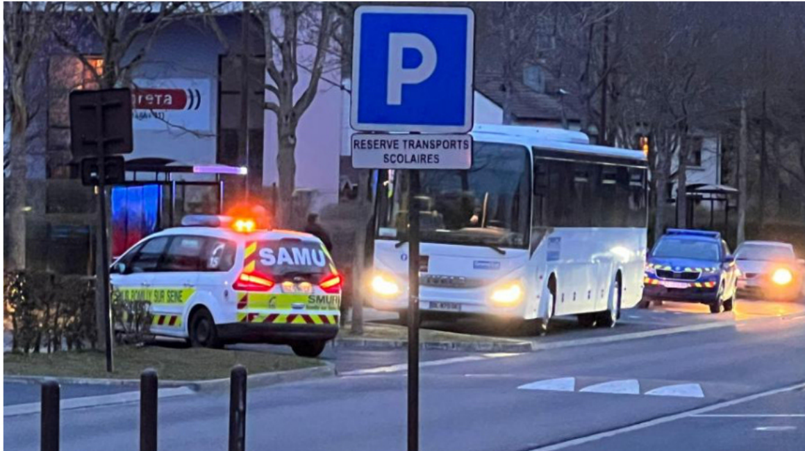
The driver was parked on the bus lanes in front of the school city of Sézanne.

A victim of heart discomfort, a bus driver died in front of the school city of Sézanne ( Marne ). The students on the bus were evacuated.