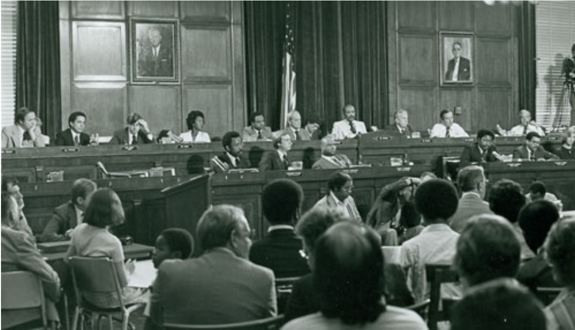
House Select Committee on Assassinations.