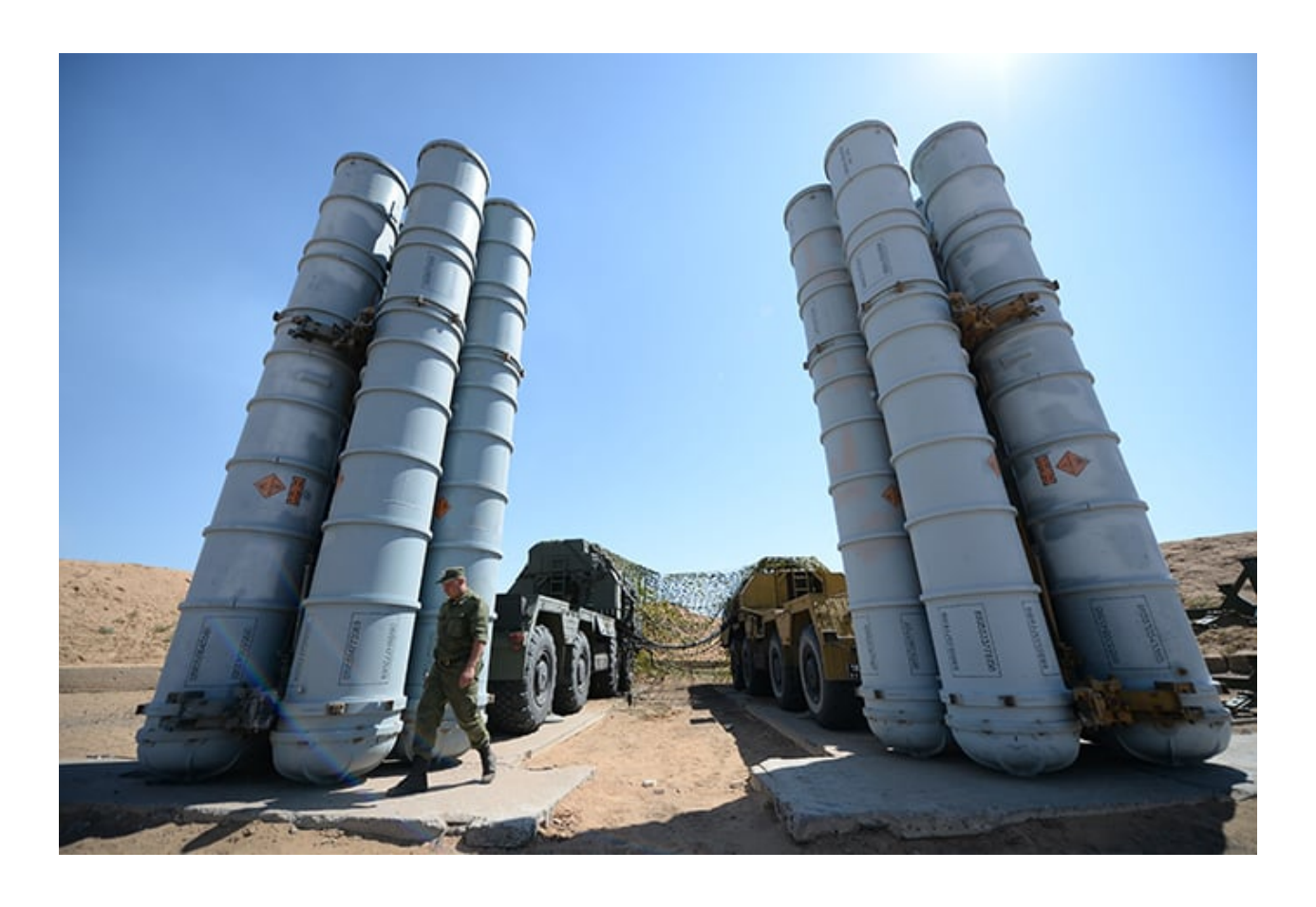
A Russian soldier during an exercise involving the S-300 surface-to-air missile systems in Astrakhan Region