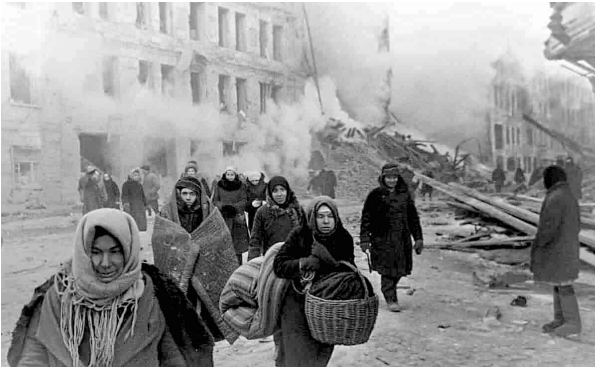
The siege of Leningrad, 1942.

Clearly, Putin was deeply offended by continual Western refusal to grasp the meaning of the war in Russia. “Desecrating and insulting the memory is mean,” Putin wrote. “Meanness can be deliberate, hypocritical and pretty much intentional as in the situation when declarations commemorating the 75 th anniversary of the end of the Second World War mention all participants in the anti-Hitler coalition except for the Soviet Union.”