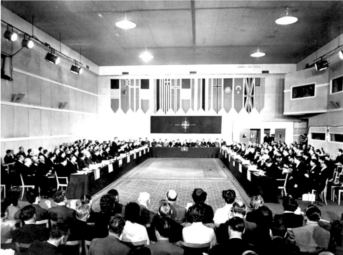
West Germany joined NATO in 1955, which led to the formation of the rival Warsaw Pact during the Cold War.