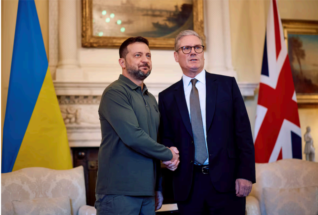
Britain's Prime Minister Keir Starmer and Ukraine's President Volodymyr Zelenskyy pose during a bilateral meeting at 10 Downing Street in central London, Britain, July 19, 2024.