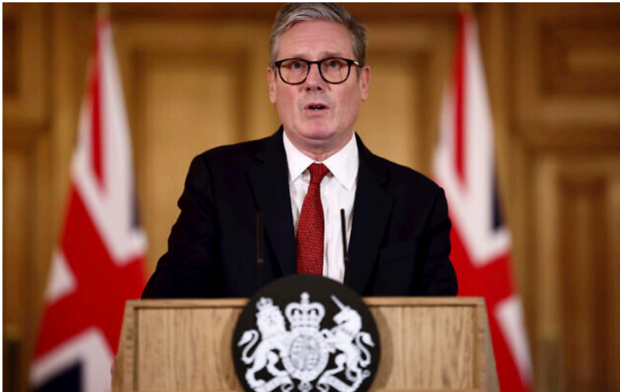
Britain's Prime Minister Keir Starmer speaks during a press conference at 10 Downing Street, London, England, on August 1, 2024, following clashes after the Southport stabbing.

Visibly Starmer has taken on a pro-Israeli stance which has a bearing on the civil rights of British citizens to act in solidarity with Palestine.