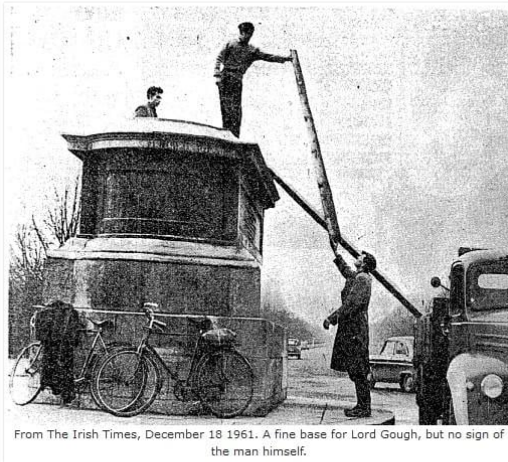
From The Irish Times , December 18 1961. A fine base for Lord Gough, but no sign of the man himself.