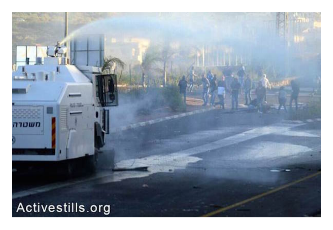
IOF forces spray Palestinian protestors with skunk water. Kafr Kama.

The Zionist entity uses "skunk water" to disperse Palestinian protestors. Skunk water was developed to leave a putrid stench & residue on the clothes and skin of protestors. While the IOF describe it as "eco-friendly", it is described by victims, as worse than raw sewage, a mix of excrement and decomposing flesh. Very similar to the liquid poured onto the church floor in Bloomsbury on Thursday, by the SSUK militants.