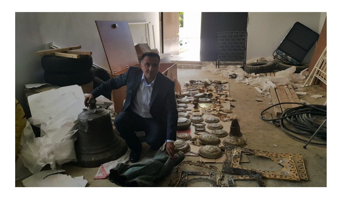
Some of the looted, broken and descrated Church belongings recovered in 2016.

I stand in solidarity with you Vanessa. Blessings from Maaloula."