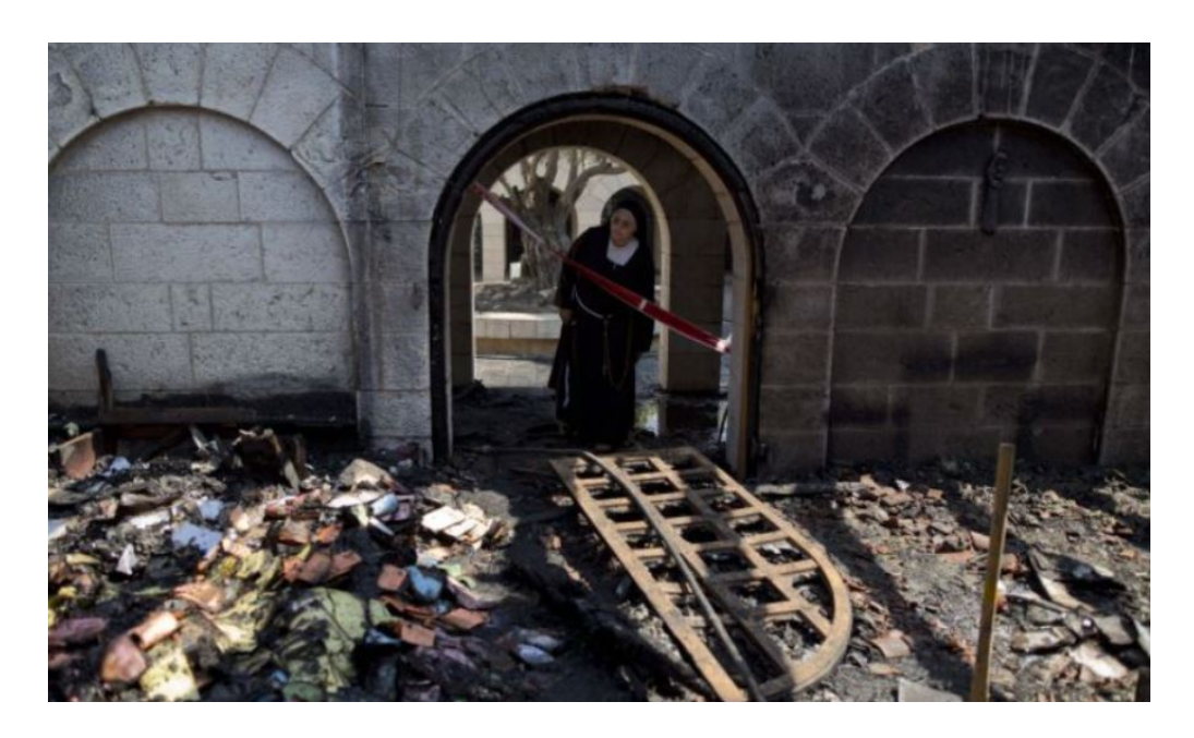
A nun inspects the damage at the Church of the Mulitplication at Tabgha.

Life under the Zionist or fundamentalist settler jackboot is the same for Palestinian muslims as it is for the indigenous Christian community. The latter is a radical, extremism that takes its origins from a distorted or selective interpretation of the Talmudic Jewish laws that condone the killing of "non-Jews" with impunity. Jewish extremism and Zionist racism run parallel and serve one another.