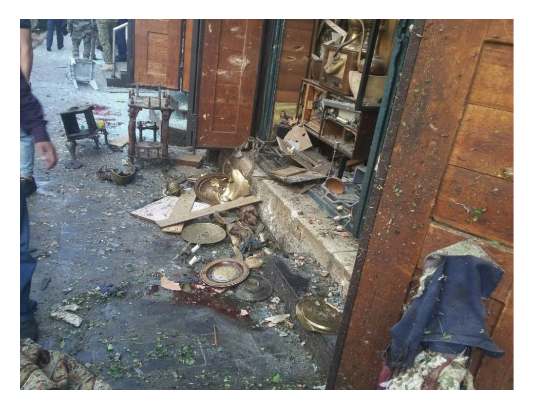
Terrorist mortar attack on the Christian quarter of Damascus three days ago. Jaish al Islam, a western backed extremist group, regularly fire mortars or explosive bullets into residential areas, focusing on the Christian area of Bab Touma. The shopkeeper was killed and a customer injured.

Three days ago the western backed "rebels", Jaish al Islam, who have embedded themselves in the subterranean catacombs of Jobar and Eyn Tarma to the east of Damascus, fired mortars into the Christian quarter of Bab Touma. They targeted a busy residential and market area in Straight Street. A shopkeeper was killed and a customer seriously injured.