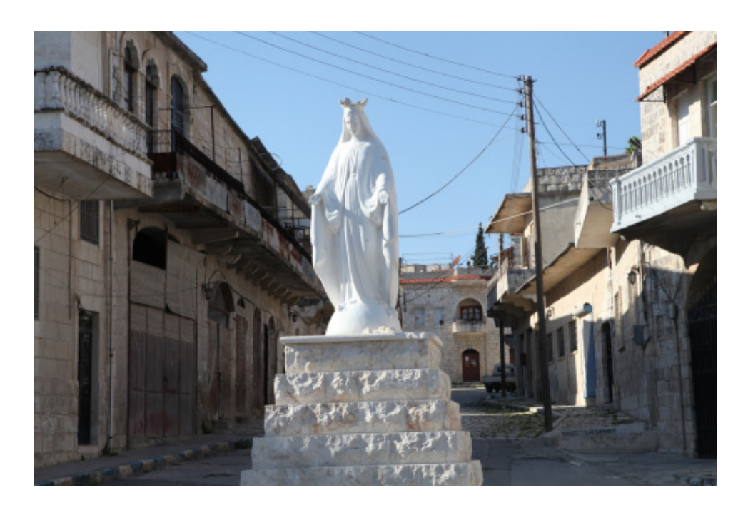
Despite fierce street fighting, the statue of the Virgin Mary remained intact, until recently.

Recently I have been having conversations with relatives of Syrian/Armenian Christians who have steadfastly remained in the US Coalition-terrorist-occupied Christian villages of Qunaye, Jdeideh and Yaqoubia in Idlib. I have been told that the statue of the Virgin Mary in Qunaye, that had remained intact up until now, has been destroyed and that crosses have been removed from the churches by the extremist factions and their White Helmet criminal cohorts.