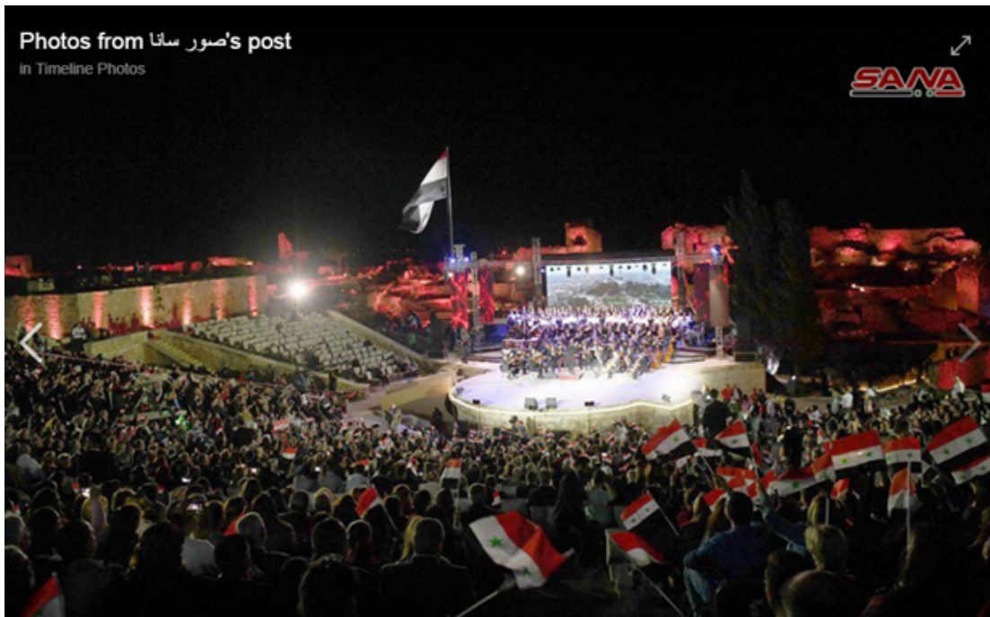
National holiday celebrations: April 17, 2018