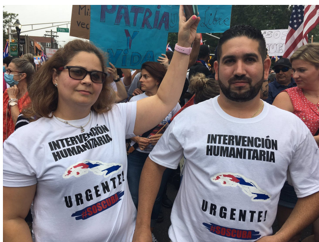
Image on the right: Rally-goers “urgently” call for “humanitarian intervention”

Should no invasion materialize, the protesters can at least take solace in the policy continuity between the Trump and Biden Administrations. In June, the US under Biden continued its normal posture of opposing a UN resolution calling on the US to rescind the