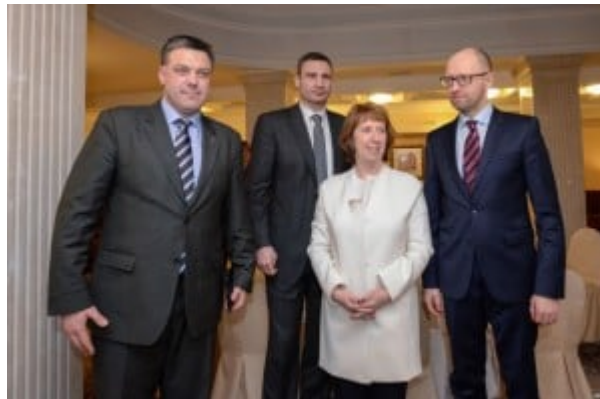
High Representative of the Union for Foreign Affairs and Security Policy for the European Union Catherine Ashton and Oleh Tyahnybok (left).