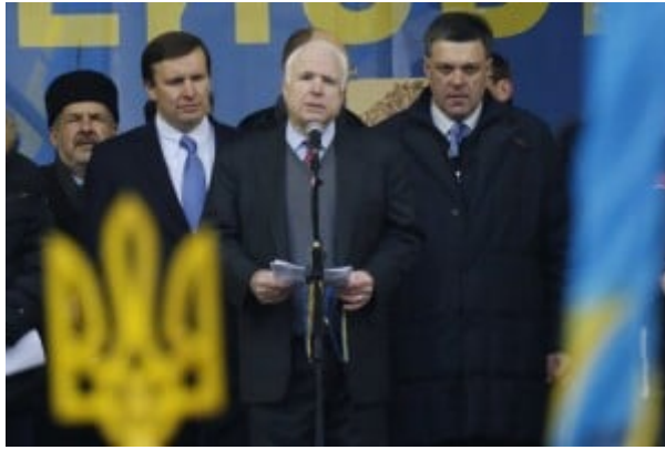
U.S. Senator John McCain with Oleh Tyahnybok (right).