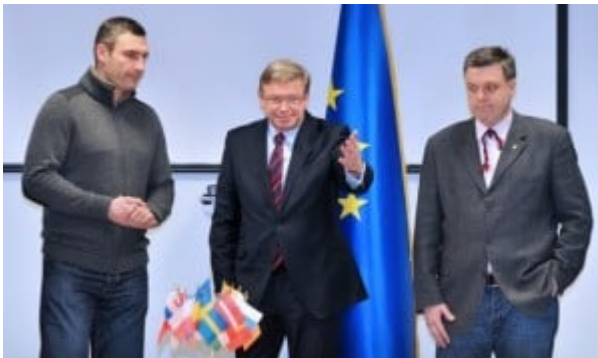
European Union Enlargement Commissioner Stefan Fuele (center) and Oleh Tyahnybok (right).

The ADL, which has expressed its concern about the Svoboda party, has yet to condemn U.S. and European support for it. In a statement published February 28, ADL's National Director Abraham H. Foxman writes: