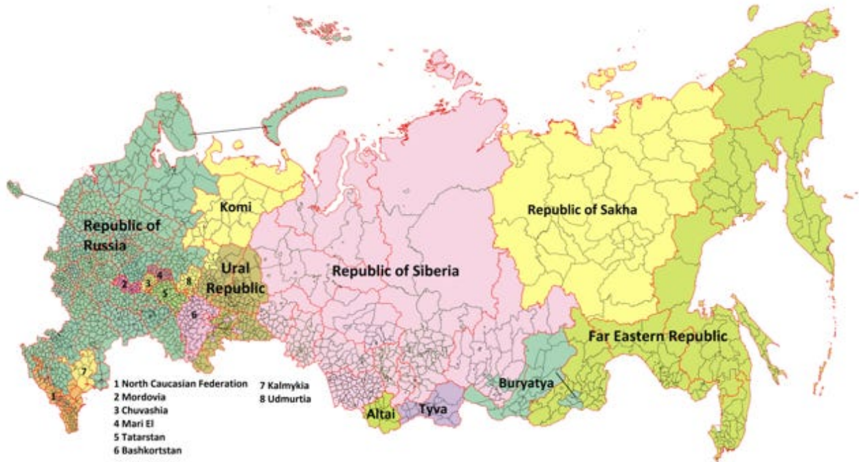
One of the many maps drawn up by fantasists who dream of partitioning Russia into a collection of smaller independent states

This panel is being led by four women and one man, all of whom have cycled through the NGO Regime Change Complex, whether it be the International Crisis Group, Radio Liberty/Radio Free Europe, the German Marshall Fund, the Soros Foundation, and so on. There are too many groups in total that they have collectively worked for to list, so we won't do that. Instead, here are their names and bios: