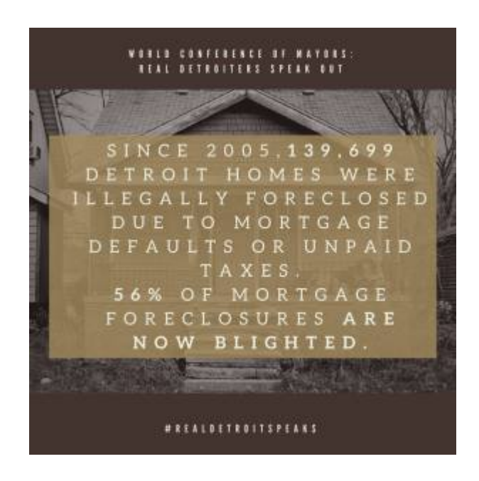
Detroit Moratorium NOW! Coalition graphic on housing crisis

The NCDA is in solidarity with the Poor People's Campaign and wants the gathering on March 24 to serve as a partial springboard for broader participation in Michigan and around the country. Also May Day has been a focus of annual unified demonstrations in Detroit since 2014 when a coalition of over 40 organizations held daylong activities culminating in a march through downtown.