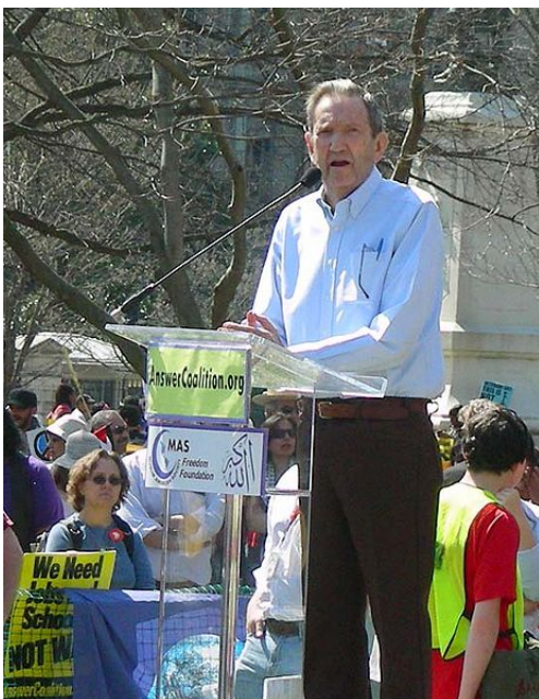
Image on the right: Ramsey Clark speaks at the March 20, 2010 anti-war protest in Washington, DC

I think both Ramsey and I would agree that perhaps the greatest man we have ever known was Sean MacBride, whose profound impact upon me has been duly recorded elsewhere. Sean was one of the great historical figures of the twentieth century. And I am sure that Ramsey would also be the first to agree that Sean was the most principled and courageous person it has ever been our pleasure to know. Indeed, it never ceases to amaze me that