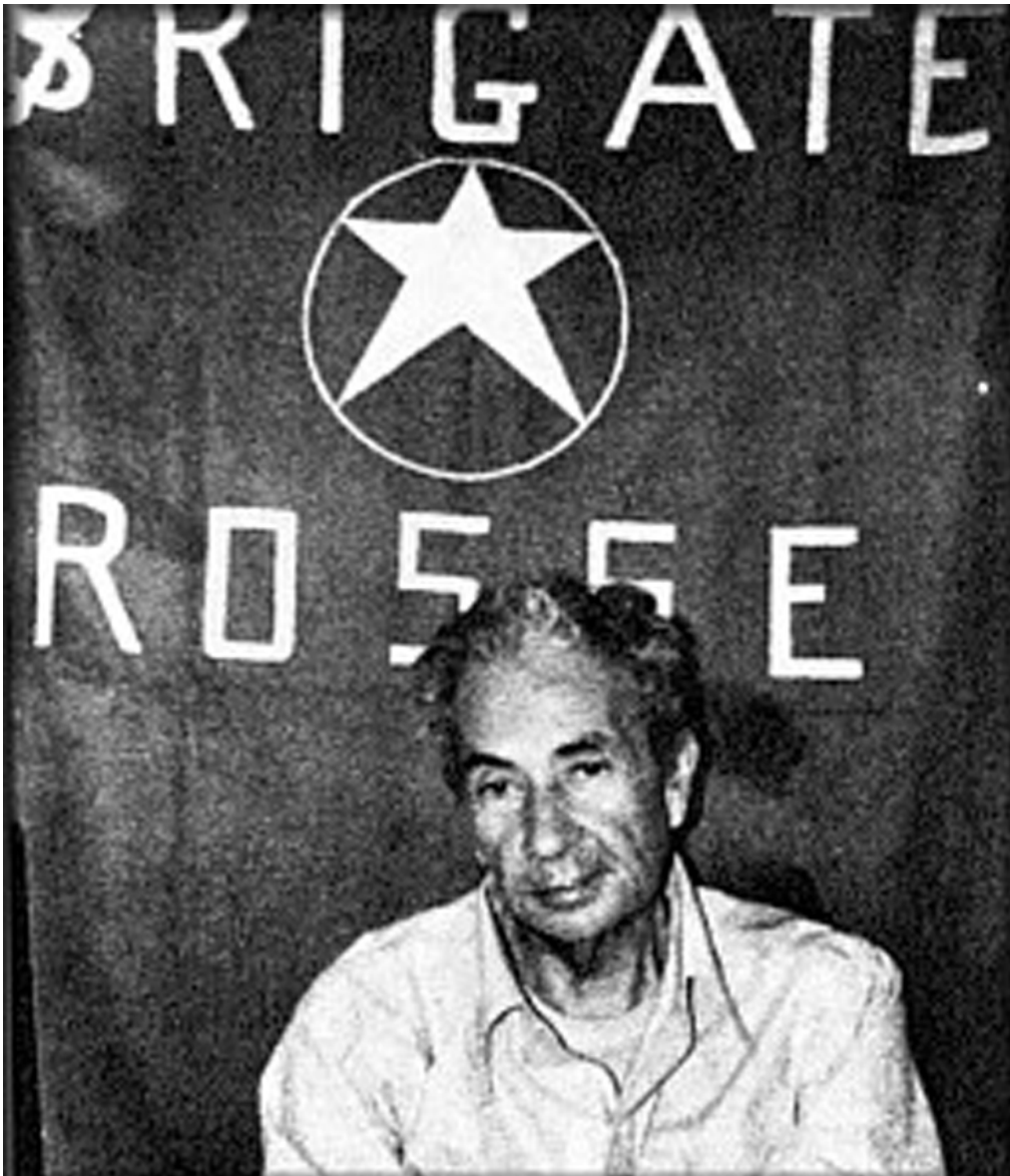
Doomed Italian PM Aldo Moro's photo while in captivity of the Red Brigades