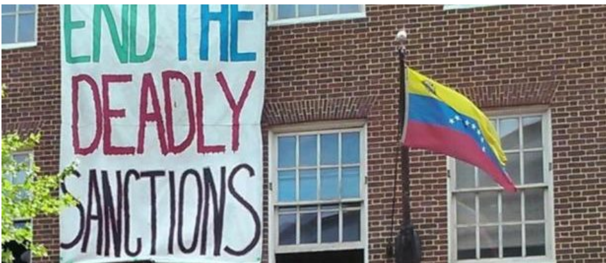
End Venezuela Sanctions sign on the Venezuela Embassy, from Venezuela Embassy Protectors Collective.

This is an opportunity to change direction. What seemed impossible in the recent past is now possible. We must seize the opportunity to create change that ensures the necessities of the people are met and the planet is protected. COVID-19 is one immediate crisis, but the climate crisis, nuclear war and economic insecurity all require solidarity between the people of the world.