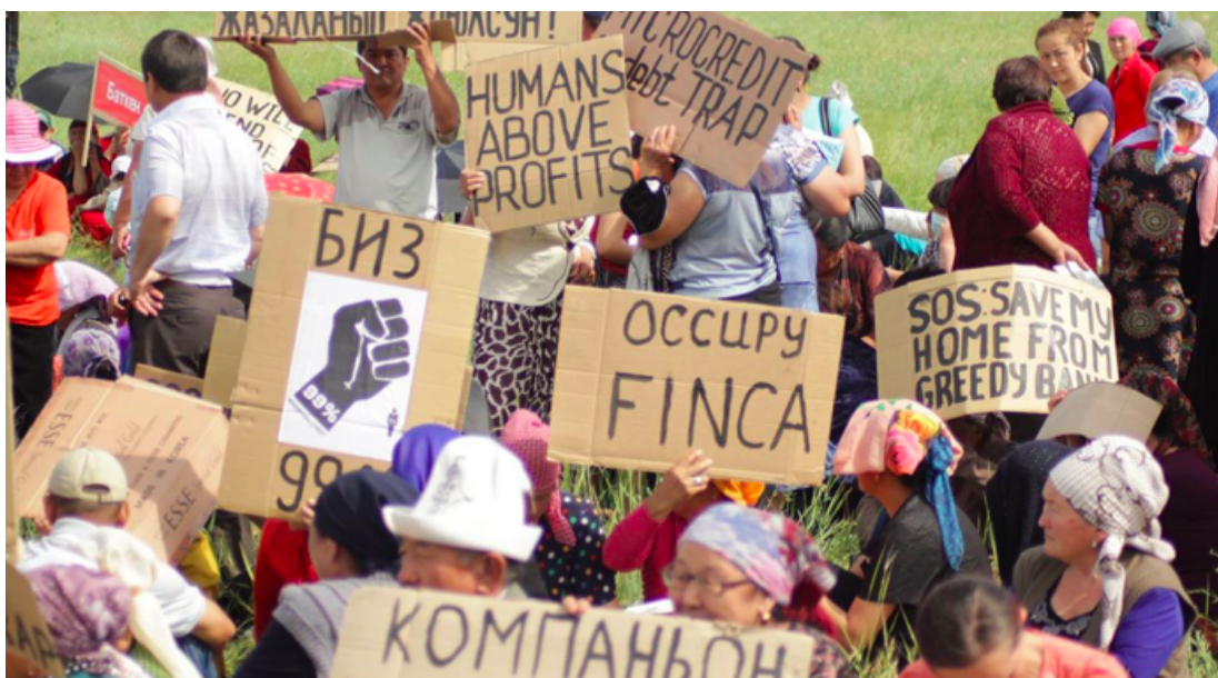
Protests outside the US embassy in Kyrgyzstan held on 26 May 2016

women have been protesting against debt, housing repossessions and exorbitant interest rates for the past 13 years. In 2016, their anti-debt struggles culminated in protests in front of the US Embassy in Bishkek, where they blamed the United States Agency for International Development (USAID) and the World Bank's International Finance Corporation (IFC) for creating and funding exploitative microcredit companies in the country. In neighbouring Kazakhstan, urban residents of Nur-Sultan and Almaty held numerous anti-debt protests in front of the central bank, blaming it for predatory lending arising from Western credit flows.