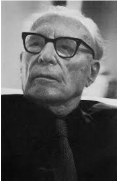
Karl August Wittfogel