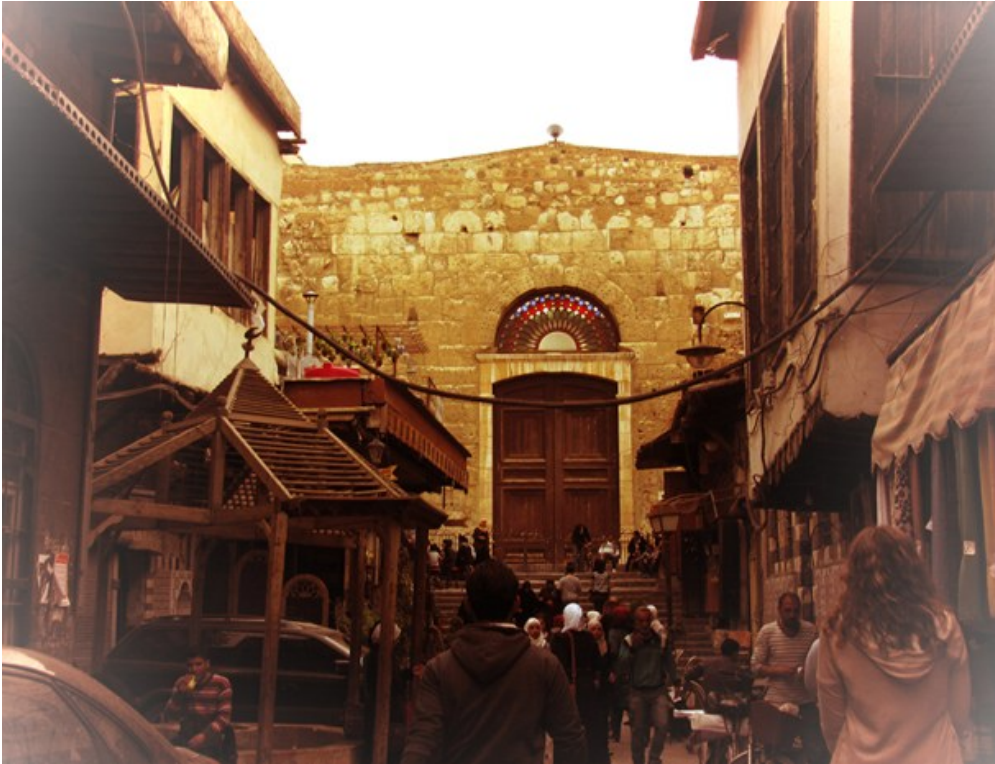
One of the largest and oldest mosques in the world, the Umayyad Mosque, in Old City, Damascus