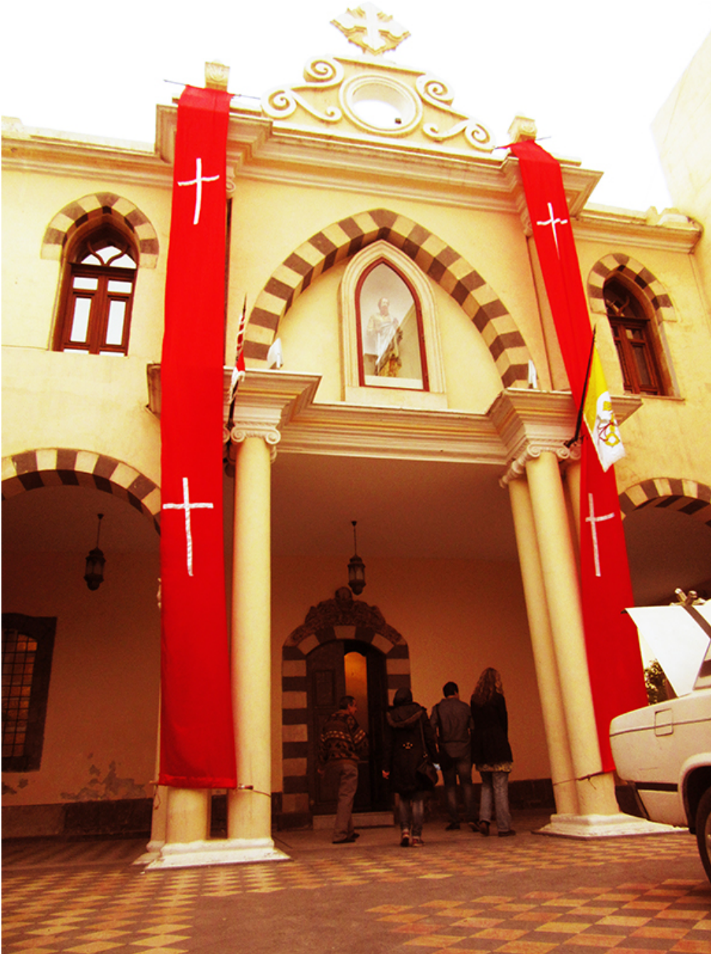
Various Christian churches are busy preparing for Easter throughout Syria. Earlier today we visited Mar Boulos Syrian Catholic Church in the Old City of Damascus

A point which has been made by journalists and travel writers who visit Damascus is that you can often see a church located next door to a mosque. It's a point worth reiterating – especially as western politicians and numerous 'experts' on Middle Eastern affairs continue to flood US television screens and talk radio, droning on endlessly about how sectarianism prevents differing communities from living together in countries like Iraq and Syria. It's simply not true, but for some macabre reason, western experts seem to want it to be so.