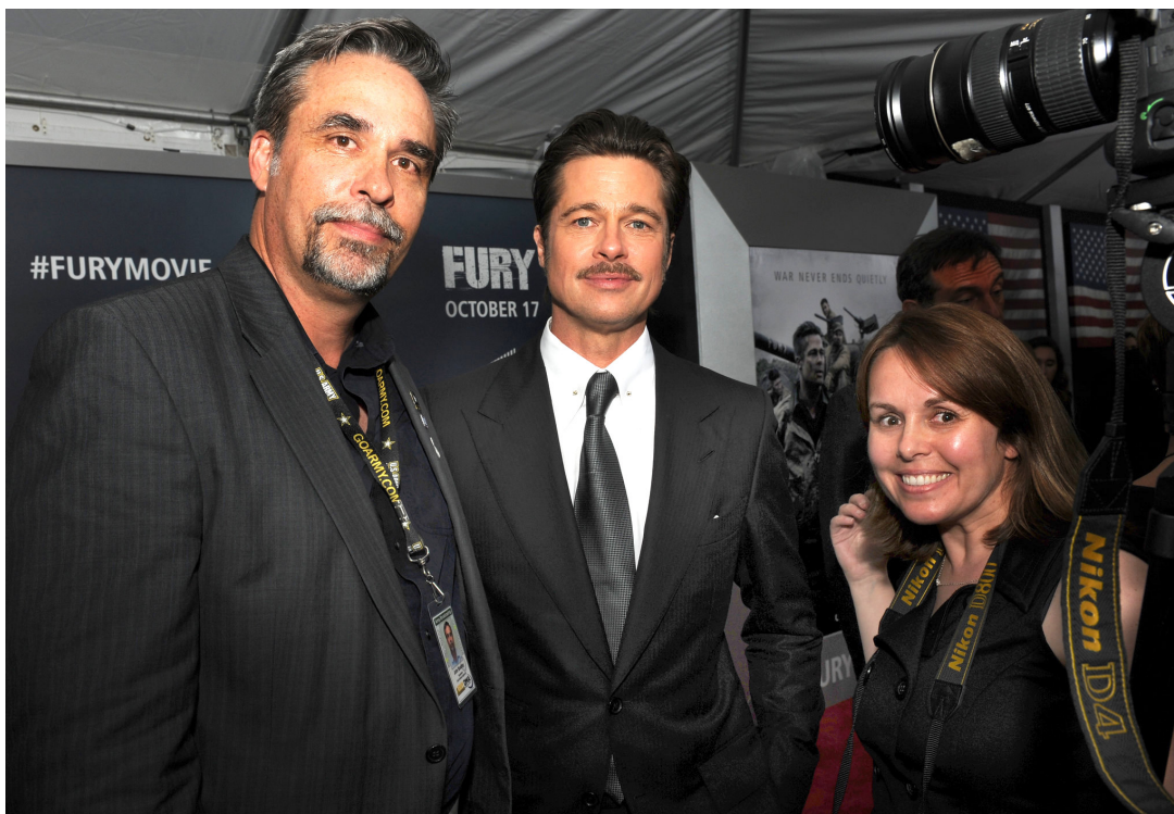
Actor Brad Pitt, center, flanked by employees of the Pentagon's Defense Media Activity, during the world premiere at the Newseum in Washington D.C. of the 2014 movie Fury , about the U.S. Army in World War II.

The alleged need to contain the Soviet threat provided an argument for U.S. government planners, notably Paul Nitze in National Security Council Paper 68 , or NSC-68, to renew and expand the U.S. arms industry, which had the political advantage of putting a decisive end