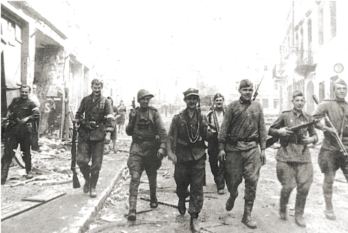
Soviet and Polish Armia Krajowa soldiers in Vilnius, July 1944.

In June 1941, without so much as a pretext or false flag, Nazi Germany massively invaded the Soviet Union. In December, the United States was brought into the war by the Japanese attack on Pearl Harbor.