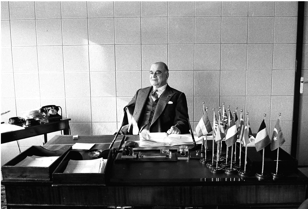
Nato Secretary General Lord Ismay in Chaillot's Palace, Paris, 1953.

The United States government wasted no time in selecting qualified Germans for their own alliance reversal. German experts who had gathered intelligence or planned military operations against the Soviet Union on behalf of the Third Reich were welcome to continue their professional activities, henceforth on behalf of Western liberal democracy.