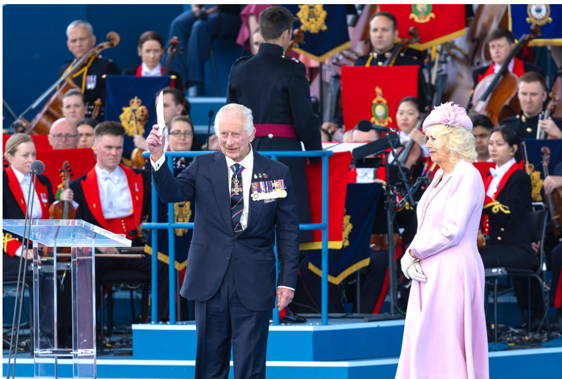
Britain's King Charles and the queen at a D-Day commemoration in Portsmouth, U.K., on June 5.

By June 1944, with the Red Army well on the way to decisively defeating the Wehrmacht, Operation Overlord was hailed by Soviet leaders as a helpful second front. For Anglo-American strategists, it was also a way to block the Soviet Westward advance.