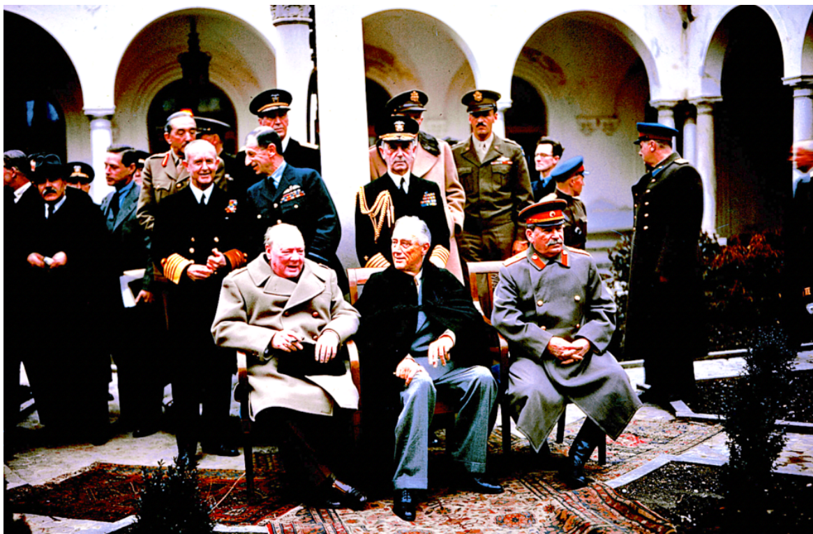
Seated from left: Churchill, Roosevelt and Stalin at the Yalta Conference in 1945.

Roosevelt seemed confident that the war-exhausted Soviet Union was no threat to the United States, which was indeed true.