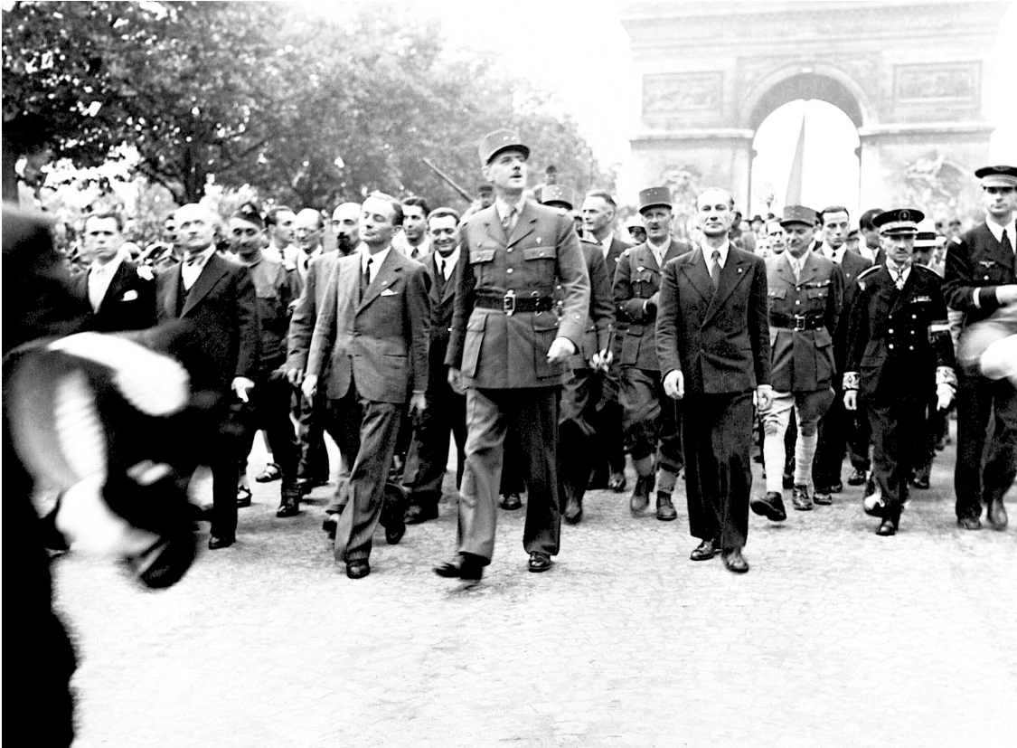
De Gaulle and entourage on the Champs Élysées following the city's liberation on Aug. 26, 1944.