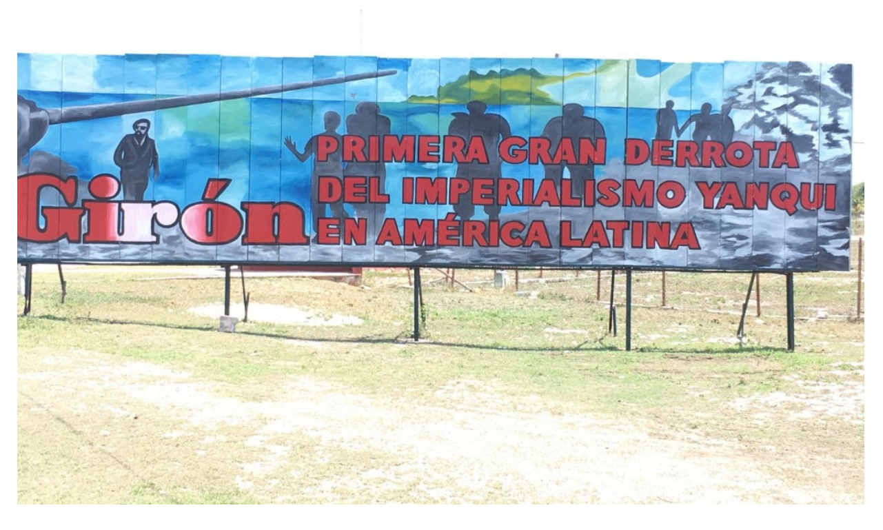
Playa Giron – first major defeat of Yankie imperialism in Latin America

I travelled Playa Giron , driving for over 250 kilometers, from Havana; first on the impressive six-lane motorway, then on a two-lane road. I had been driven and I drove the 1952 Chevrolet, painstakingly restored, shiny and still a reliable friendly monster.