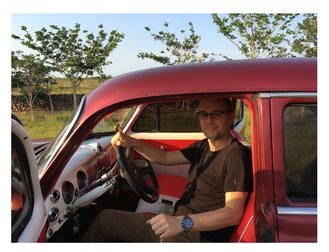
Me and my 1952 horse

Cuba was changing, impressively, and I saw it all around me. The terrible years of extreme sacrifice were over. There were now excellent roads all over the island, comfortable and clean rest stops and fuel stations.