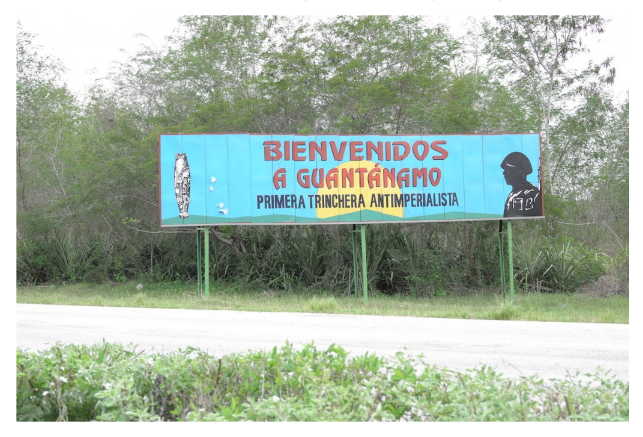
Guantanamo – first line of defense against imperialism

Here too, I spoke to people. Some were indignant about the base, some indifferent. But there was no fear, and absolute certainty that the Cuban political system will survive.