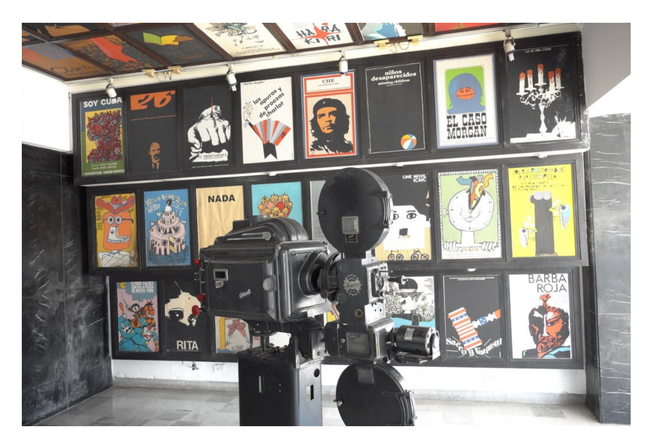
Obsession with culture - Chaplin Cinema in Havana

There was more talk about "peace" and "understanding".