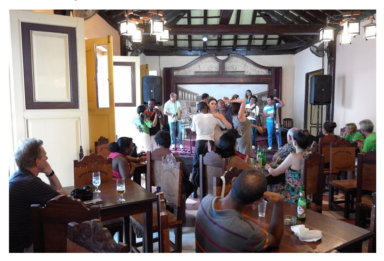
Casa de la Trova – all mixed couples

Like Salvador Bahia in Brazil, Santiago de Cuba gave the world some of the finest musicians. Now, in legendary Casa de la Trova and in many other clubs, cabarets and music halls of the city, mixed couples of all races are dancing to the upbeat rhythms of son and salsa. In Cuba, racism is a foreign unknown factor.