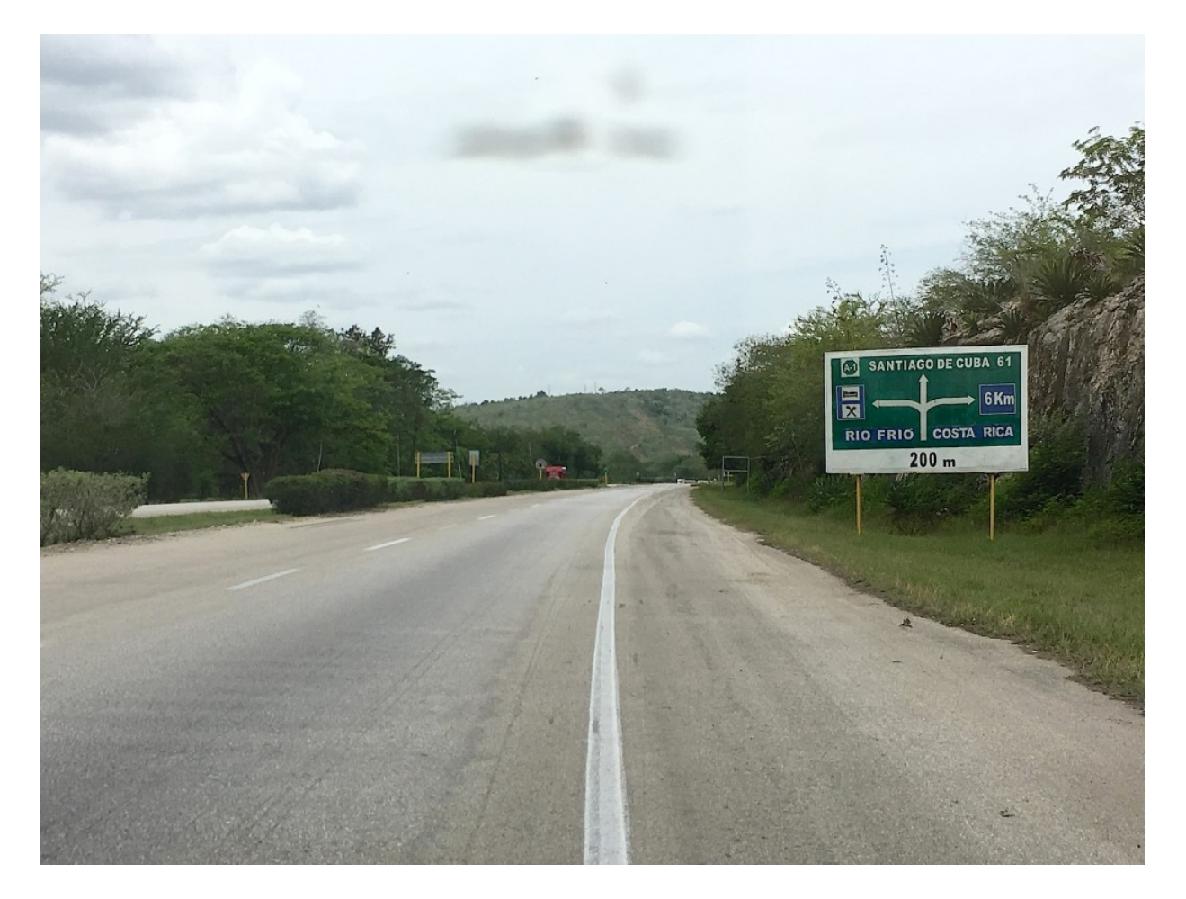
New motorways everywhere

Now the road originating from the motorway and leading all the way to Playa Giron is lined with monuments to fallen Cuban men and women who defended their motherland against the mightiest imperialist country on earth. Countless powerful posters keep reminding the travellers: