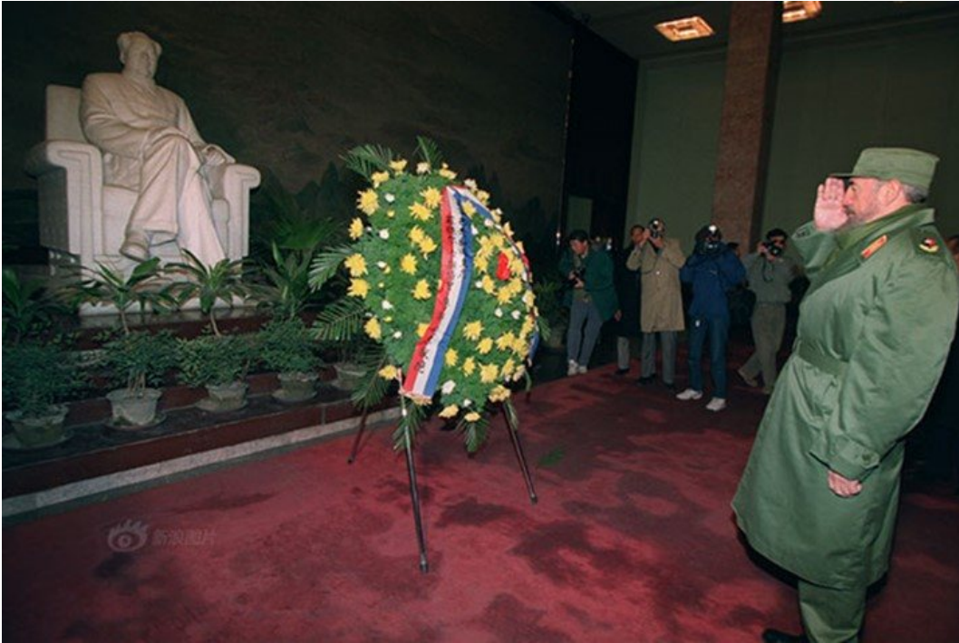
Fidel Castro salutes the statue of Mao Zedong