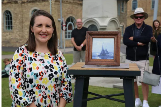
Antiques Roadshow's Theo Burrell has given an update on her terminal cancer diagnosis

Antiques Roadshow star Theo Burrell has shared a health update after being diagnosed with incurable brain cancer.