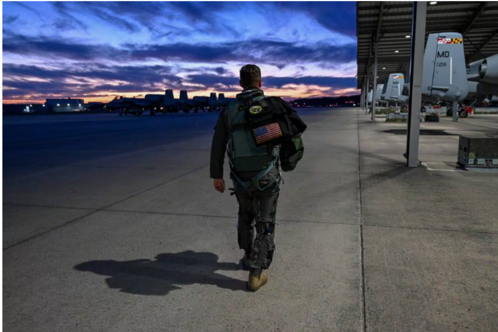
A pilot assigned to the 104th Fighter Squadron prepares to conduct a night flying mission as part of