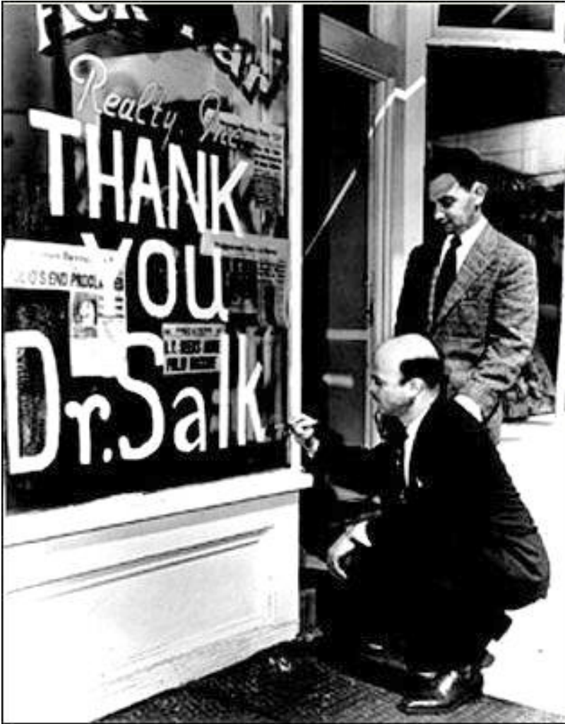
Jonas Salk's vaccine wiped out polio in the United States, and he didn't patent it.

Mass vaccination has always been the surest way to wipe out deadly diseases. It is also an instance where individual freedoms need be sacrificed to the general good. It is deeply disturbing that many intelligent people are more afraid of the vaccine that may be developed to combat this virus than they are of the virus itself.