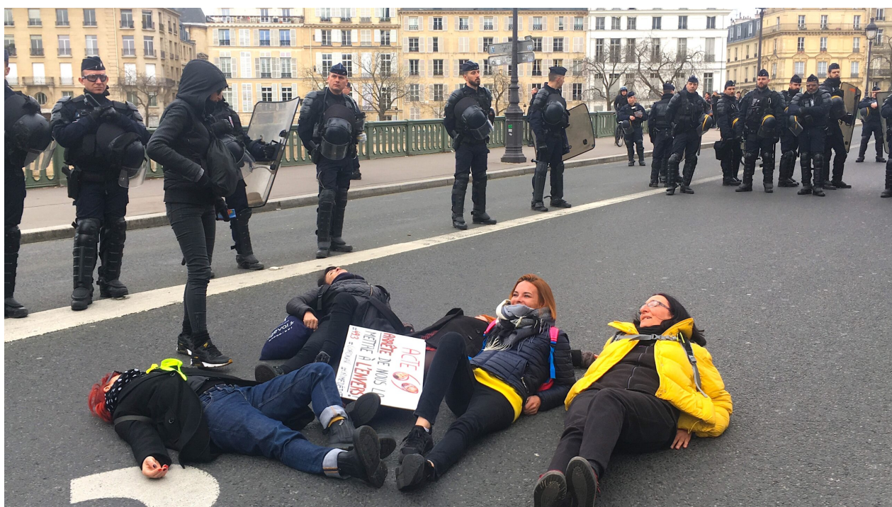
Yellow Vests protest, March 7, 2020 in Paris before lockdown. (Joe Lauria)

In France, labor unions and progressives are demanding better protection of the population, starting with all those essential service workers, in hospitals and grocery stores, bus drivers, deliverymen, all those who are increasingly appreciated by their confined compatriots and who need to reap the benefits of their public service.