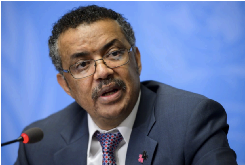
Tedros Adhanom Ghebreyesus in 2016. He has been accused of covering up cholera outbreaks by an associate of a rival for World Health Organization director general.

A massive vaccine campaign has been ordered by the Director General of the WHO Tedros Adhanom Ghebreyesus. Numerous pharmaceutical companies are already working on the development of a vaccine .