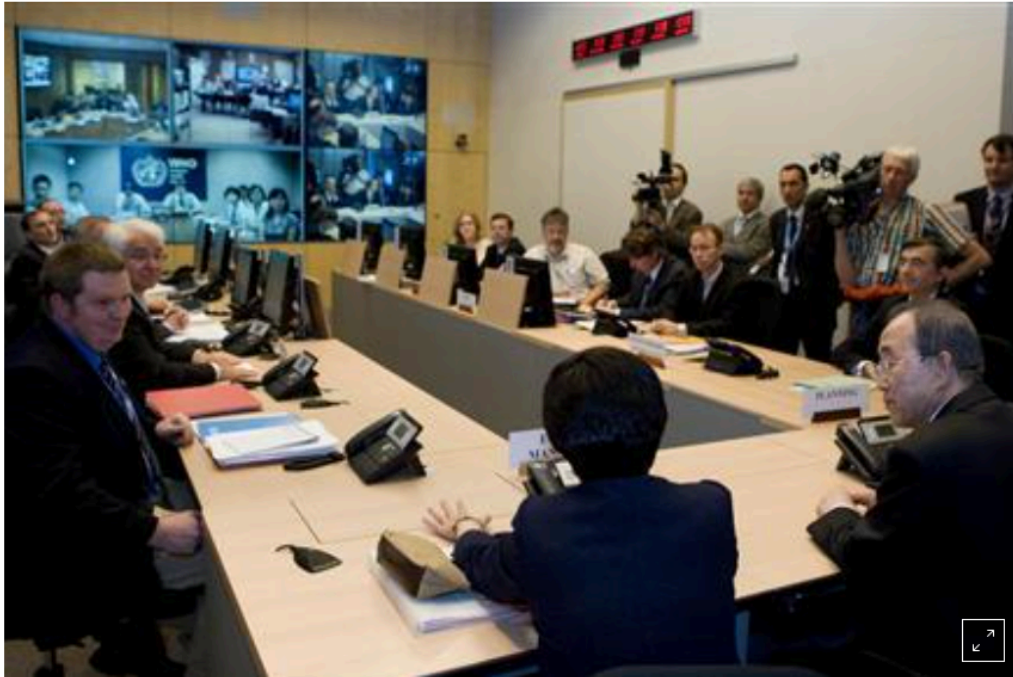
United Nations Secretary-General Ban Ki-moon (R) listens to WHO Director-General Margaret Chan (C) during a visit to the Strategic Health Operations Centre (SHOC) room at the World Health Organization (WHO) headquarters in Geneva, May 19, 2009.

GENEVA (Reuters) - Vaccine makers could produce 4.9 billion pandemic flu shots per year in the best-case scenario, the head of the World Health Organization said on Tuesday, as rich and poor countries grappled over limited supplies.