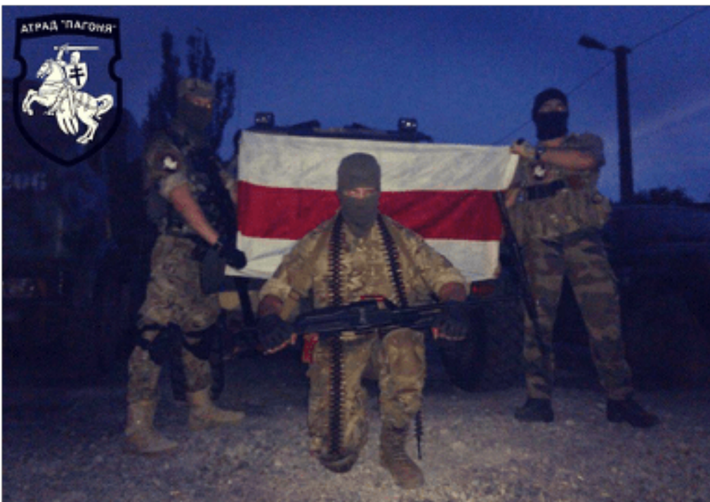
The Pahonia Detachment also identifies with the historic legacy of the Belarusian People’s Party, as is apparent from the widespread use of the white-red-white flag on the detachment’s social media accounts.

Another murky figure in the Ukrainian-Belarusian-Polish regime-change axis, is the Polish “photojournalist” Witold Dobrowolski , traveling the world to “report” on violent uprisings, from Maidan, over Hong Kong to the recent protests in Belarus. His photos show that he is always just a step away from the neo-Nazi black block when attending demonstrations. Dobrowolski, formerly the editor of the Polish neo-Nazi magazine SZTURM , has been associated with key figures of the Ukrainian neo-Nazi scene and with entities known for their