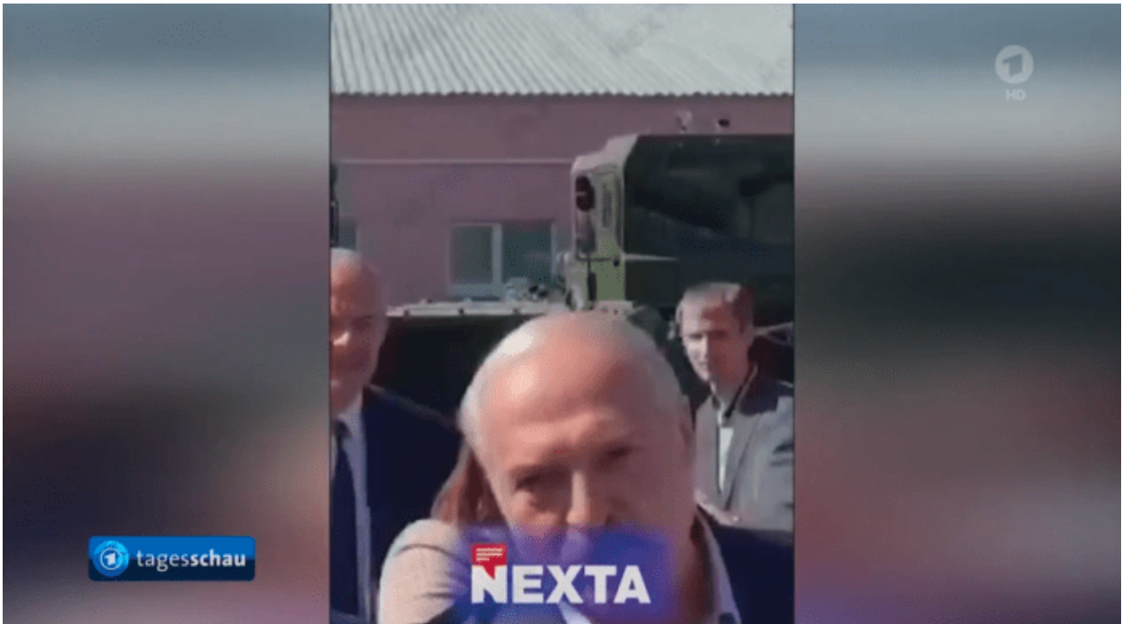
Nexta footage on Germany's first public broadcasting channel, ARD.

While in the course of the protests the independent Belarusian news landscape was practically shut down, only Nexta has continually managed to publish reports from inside the country, and by now has become one of the most quoted "sources" in Western mainstream media. As the BBC wrote , "Nexta ... has managed to bypass many of the restrictions" and, when the protests started to intensify, the exposure of Nexta simply exploded: "Within hours, its audience grew on election night by 100,000 and then after two nights of protests it had amassed more than a million."