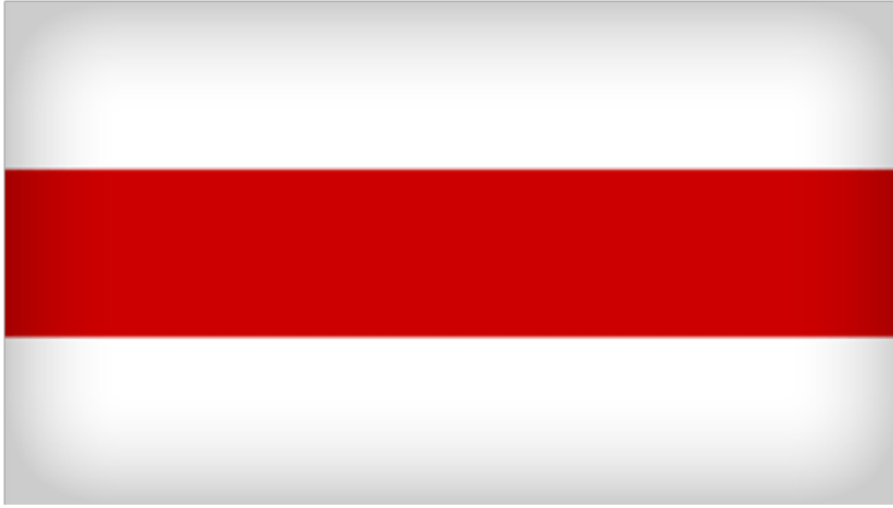
Top: Coat of Arms of the Belarusian People's Republic, known as Pahonia. Bottom: Flag of the Belarusian People's Republic.

As is the case with the current protests, during the run-up to the 2006 Jeans revolution, white-red-white flags were waved by the demonstrators. But when their usage was outlawed starting in late 2005, the Belarusian opposition adopted denim as a symbol of protest. [1] In the former Soviet Union, denim was often identified with Western culture and the fabric symbolized the pro-Western sentiment of the anti-Lukashenko opposition of the time.