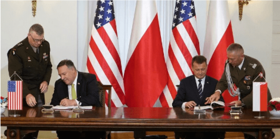
U.S. Secretary of State Mike Pompeo (left) and Poland's Minister of Defense Mariusz Blaszczak (right) sign the U.S.-Poland Enhanced Defense Cooperation Agreement in the Presidential Palace in Warsaw, Poland, on August 15, 2020.

As CAM reported , on August 15, 2020, not even a week into the protests in Belarus, U.S. Secretary of State Mike Pompeo signed a military cooperation agreement with Poland that provides for more American troops to be stationed in the country. The agreement goes hand in hand with Donald Trump's decision to reduce the number of American troops in Germany. At the end of July, the Pentagon announced the withdrawal of 12,000 troops from Germany, of which around 5,600 are to be moved to other European countries including Poland. Furthermore, several U.S. military commands will move out of Germany, including the U.S. Army V Corps overseas headquarters , which will relocate to Poland in 2021.