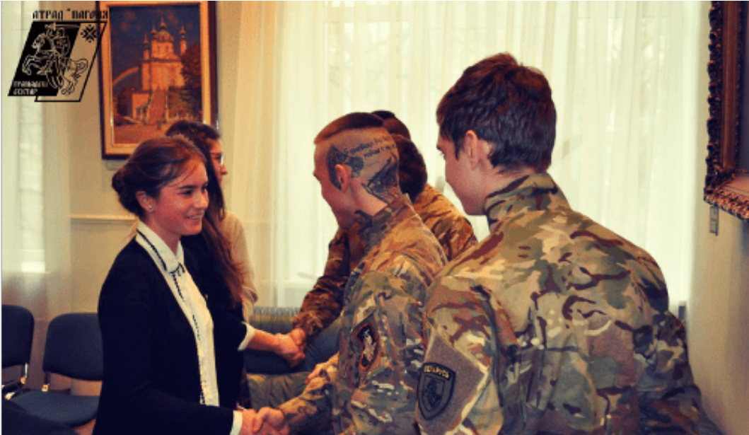
Top: The Pahonia Detachment (badge with mounted knight) commemorated in an Ukrainian exhibition alongside the Azov battalion. [Source: Facebook]; Center: Picture posted by the Pahonia Detachment on April 4, 2018, on Facebook, subtitled: “On the way to the front.” [Source: Facebook ]; Bottom: Members of the Pahonia Detachment. Note the Odinst tattoos on neck and face. [Source: Facebook ]