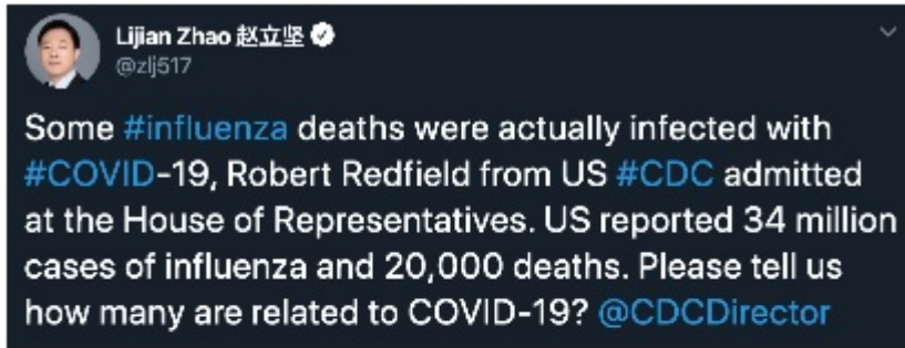
Screenshot of Chinese Foreign Ministry spokesperson Zhao Lijian.

— Hua Chunying 胡锦涛 (@SpokespersonCHN) March 12, 2020