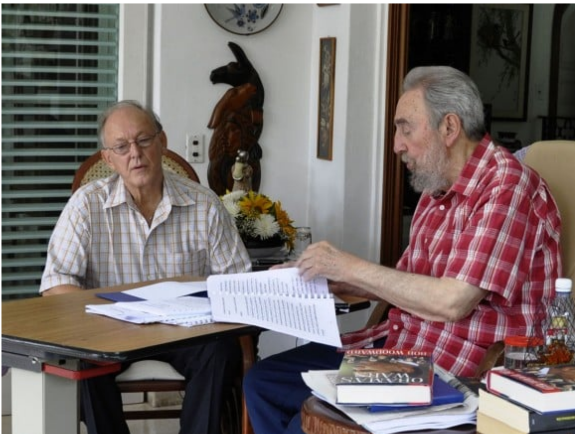
Notice the Book by Bob Woodward entitled Obama's Wars. Fidel had ordered a copy when it was launched, delivered to him in the UN diplomatic pouch. He had read it cover to cover when I met up with him on October 12, 2010