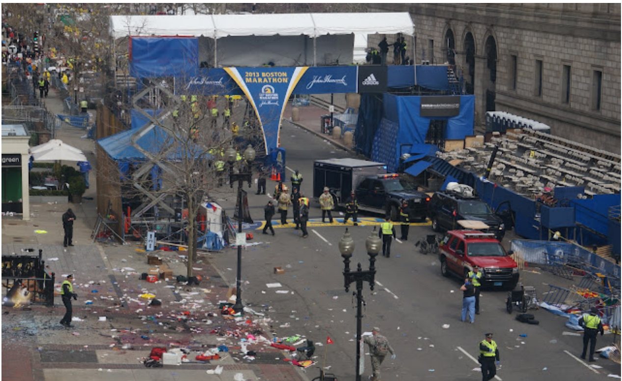
Image: The FBI truck and contractor SUV sit seemingly abandoned - neither the FBI agent, nor the contractors can be seen. What they did, or where they went remains so far, unknown. (click to enlarge)