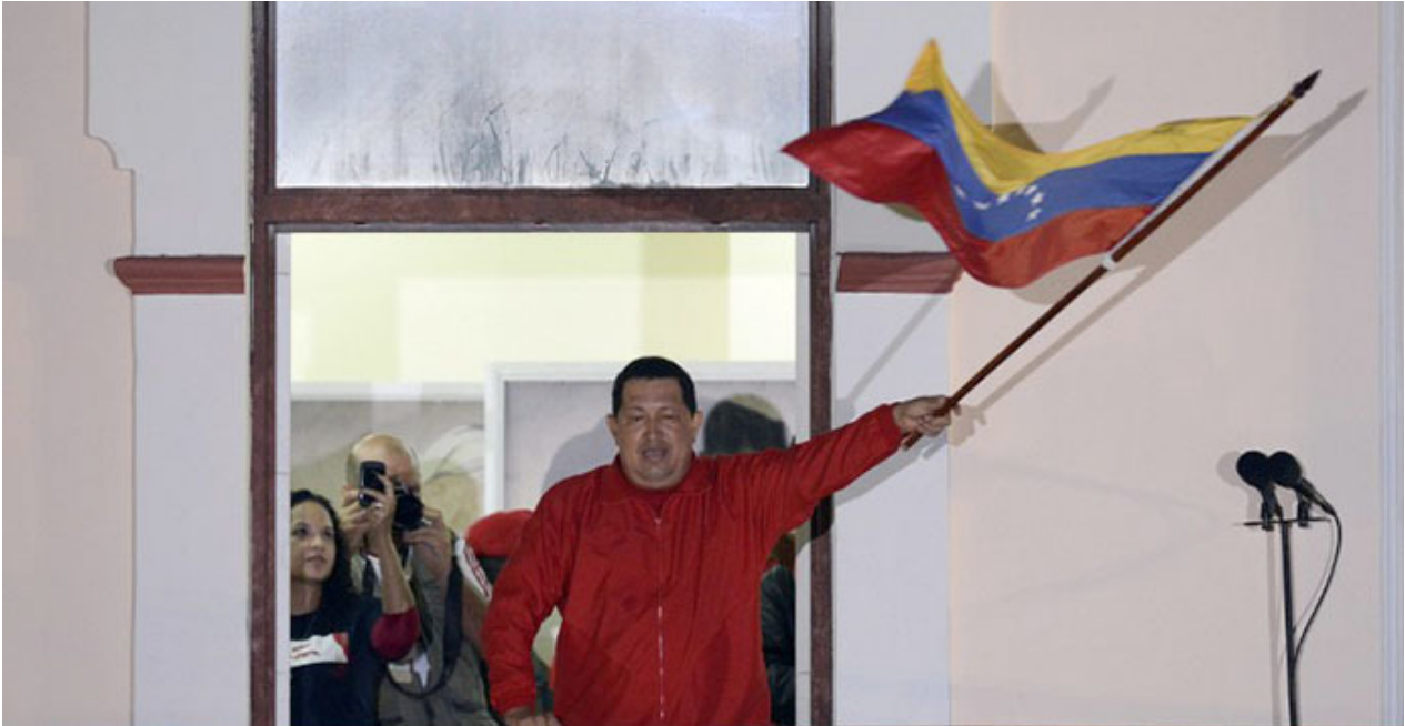
Venezuelan President Hugo Chavez waves a Venezuelan flag while speaking to supporters after receiving news of his reelection in Caracas on October 7, 2012.

In Western elite circles, it's OK to claim Iraq possessed WMDs when it didn't. It's OK to say Iran has a nukes program. It's OK to say that the Syrian government launched chemical weapons attacks against its own people. It's OK to say that Hugo Chavez engaged in the 'widespread fixing' of elections. When the country being discussed is an 'official enemy', you don't need much, if any, evidence to make claims against it. The claim doesn't even have to be logical.