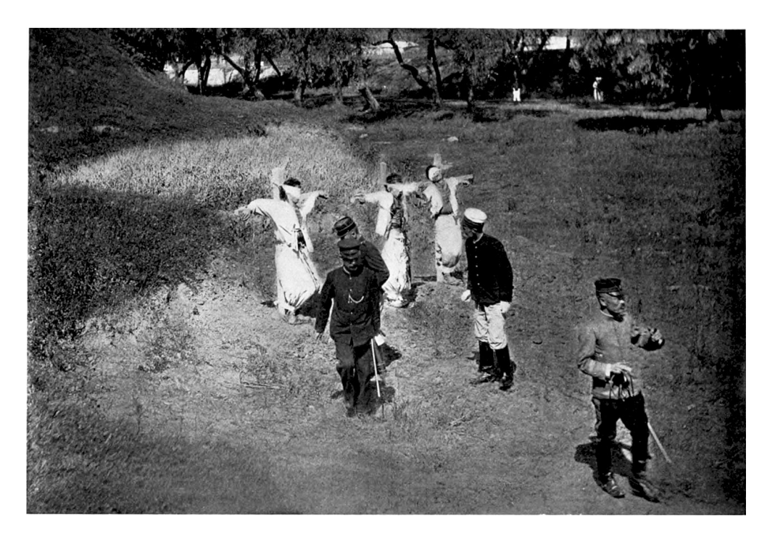
Three Koreans shot for pulling up rails as a protest against seizure of land without payment by the Japanese

The Korean patriots fought against the Japanese government mainly in Manchuria, China and the Korean peninsula. Many of them fought alongside with the Chinese and the Russian army. Their political leader was Kim Koo who was the president of the Provisional Government of the Republic of Korea established in 1919 operating in China. Kim Koo came back to Korea in 1945 with the hope to establish an independent government excluding the collaborators, but he was assassinated in 1949 by the government of Rhee Sygnman. A great number of Korean patriots were assassinated or fled to North Korea.