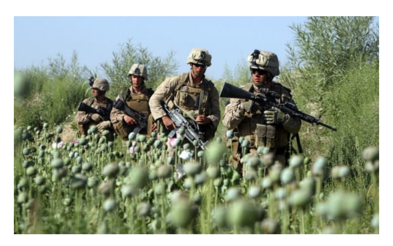
US soldiers in Afghanistan's poppy fields

It has to be asserted that Afghanistan's prolonged war is largely built around the deterrence and compellence policies that materialize the objective of a hegemonic role over the world.