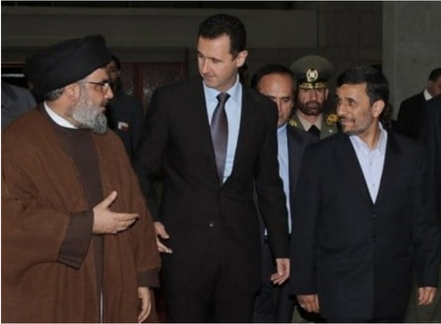
First photo above: Syrian Defence Minister Dawoud (David) Rajha visiting the docked Russian aircraft carrier Admiral Kuznetsov in the Syrian port of Tartus on January 8, 2012. Above photo: Syrian allies, Secretary-General Hassan Nasrallah of Hezbollah and Mahmoud Ahmadinejad of Iran, join President Bashar Al-Assad for a summit in Damascus, Syria on February 25, 2010.