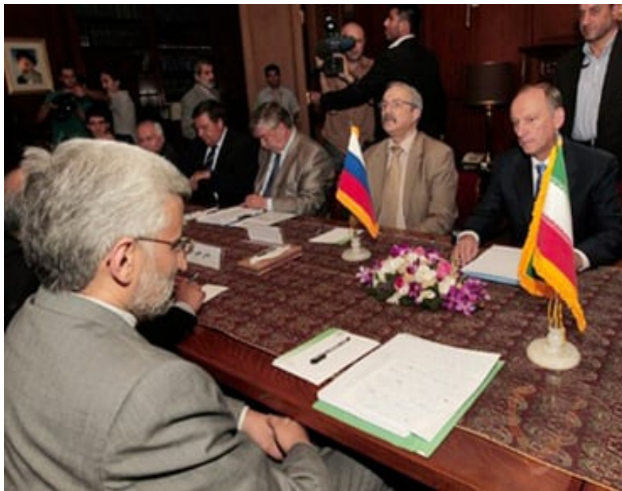
Above photo and second above photo: Secretary-General Jalili and Secretary Patrushev in Tehran, Iran holding Iranian-Russian national security talks during August 2011.