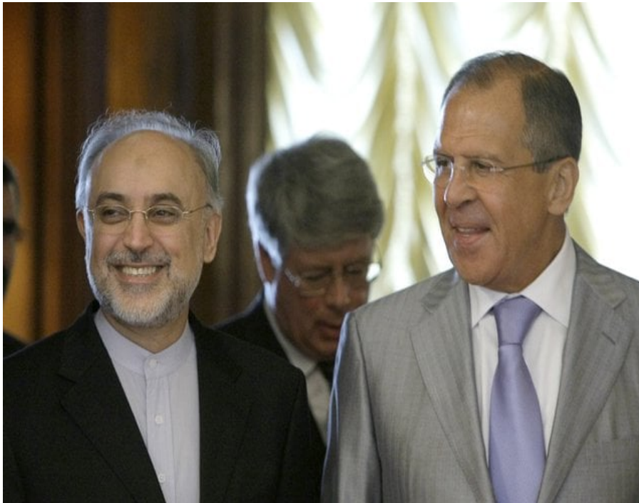
Above photo: President Mahmoud Ahmadinejad of Iran and President Dmitry A. Medvedev of Russia during a bilateral meeting in Dushabe, Tajikistan.

The bilateral Iranian-Russian meeting was held on the sidelines of a Shanghai Cooperation Organization summit on August 28, 2008.