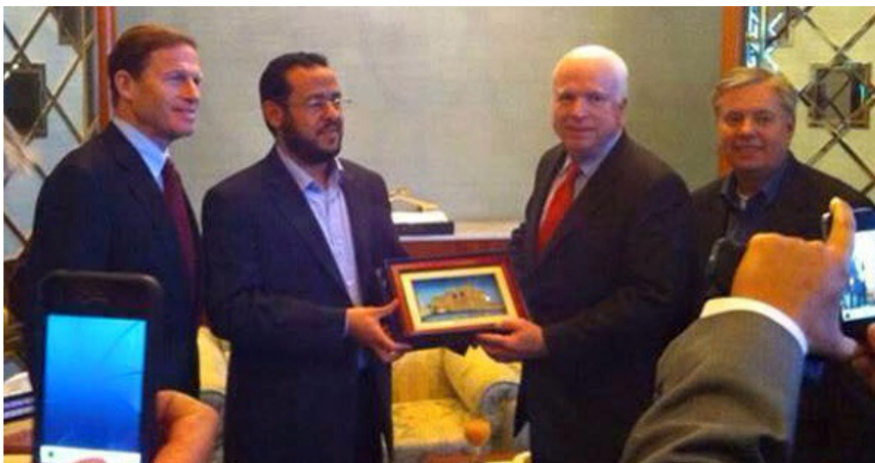
Image; US Senator John McCain posing with Al Qaeda’s LIFG leader Hakimabduallah Belhaj, now head of ISIS’ Libya franchise. The US along with other NATO and Persian Gulf states, provided Belhaj’s terrorists air cover, weapons, cash, and special forces in their bid to overthrow the government of Libya in 2011.

Readers of the Daily Beast might be tempted to believe that the US plans to either begin arming these extremists groups – ignorant of the fact that they have already been armed by the West and its allies for years – or will increase existing support. However both assumptions would be wrong. Every dollar, every weapon, and every foreign fighter on Earth the US and its collaborators could find and feed into the Syrian conflict has already been sourced and sent to Syria . It simply has not been enough.