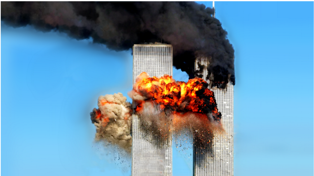
Image: September 11, 2001, nearly 3,000 people would die in attacks on the World Trade Center in New York City, the Pentagon in Washington D.C., and a downed plane over Pennsylvania. The attack was attributed to Al Qaeda by the United States government tipping off over a decade of global war against “terrorism” that would leave entire nations destroyed and millions of lives ruined.

The Daily Beast’s article, “ Petraeus: Use Al Qaeda Fighters to Beat ISIS ,” reveals the final piece to the “ safe haven ” or “ buffer zone ” puzzle, providing the world a complete picture of how the United States and its regional allies, including Turkey, Saudi Arabia, Israel, Jordan, and others, plan to finally overthrow the government in Damascus, and eliminate Syria as a functioning nation state through the use of listed terrorist organizations responsible for over a decade of devastating global war.