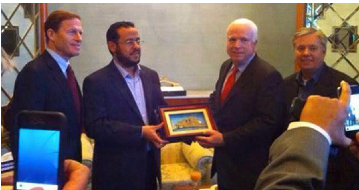
Image; US Senator John McCain posing with Al Qaeda’s LIFG leader Hakimabdullah Belhaj, now head of ISIS’ Libya franchise. The US along with other NATO and Persian Gulf states, provided Belhaj’s terrorists air cover, weapons, cash, and special forces in their bid to overthrow the government of Libya in 2011.

Readers of the Daily Beast might be tempted to believe that the US plans to either begin arming these extremists groups – ignorant of the fact that they have already been armed by the West and its allies for years – or will increase existing support. However both assumptions would be wrong. Every dollar, every weapon, and every foreign fighter on Earth the US and its collaborators could find and feed into the Syrian conflict has already been sourced and sent to Syria . It simply has not been enough.