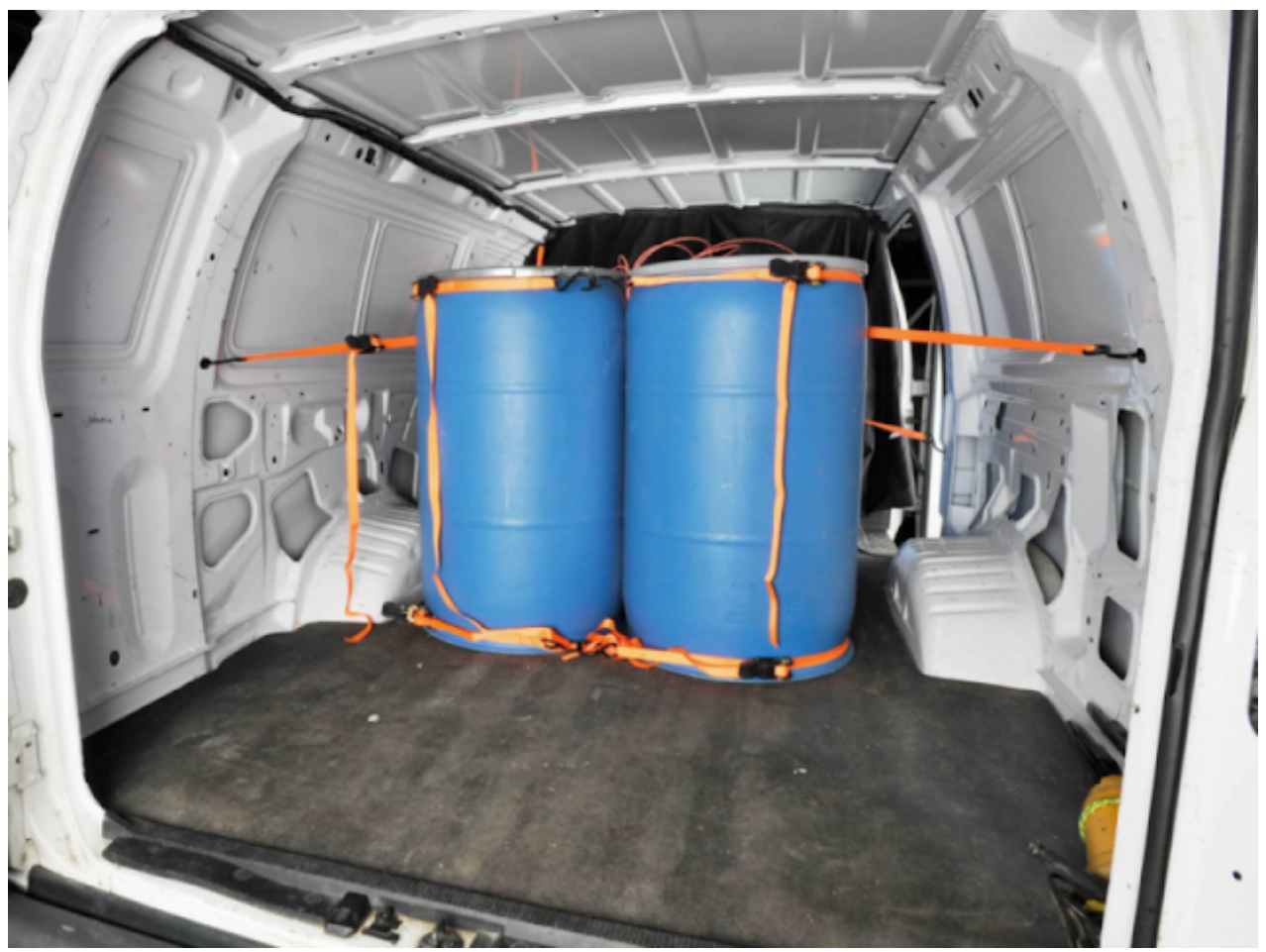
Image: The bomb the FBI constructed for the Portland "Christmas tree bomber."

USA Today reported in their article, "FBI foils alleged suicide bomb attack on U.S. Capitol," that (emphasis added):