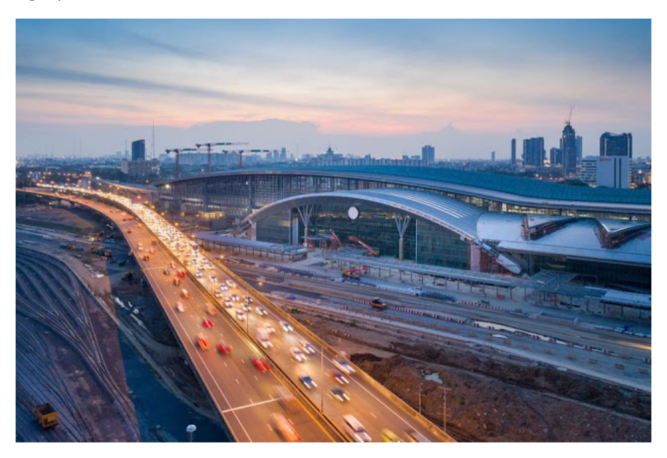
Thailand's massive Bang Sue Grand Station nears completion and will serve as a terminal for Chinesebuilt high-speed trains.

It should be noted that not only does the "hyperloop" exist only as crude prototypes versus China's high-speed rail technology already moving billions of people a year – the Thai-Chinese high-speed rail line is already under construction with a new grand station nearing completion built specifically to serve as, among other things, a terminal for Chinese-built high-speed trains.