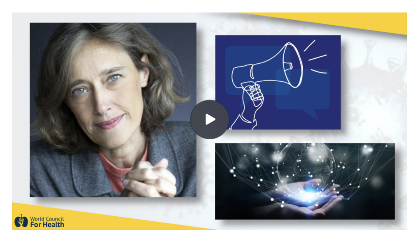
Click here to watch the video

Addressing the challenge of reaching the masses with accurate information amidst widespread propaganda and the demands of the attention economy.