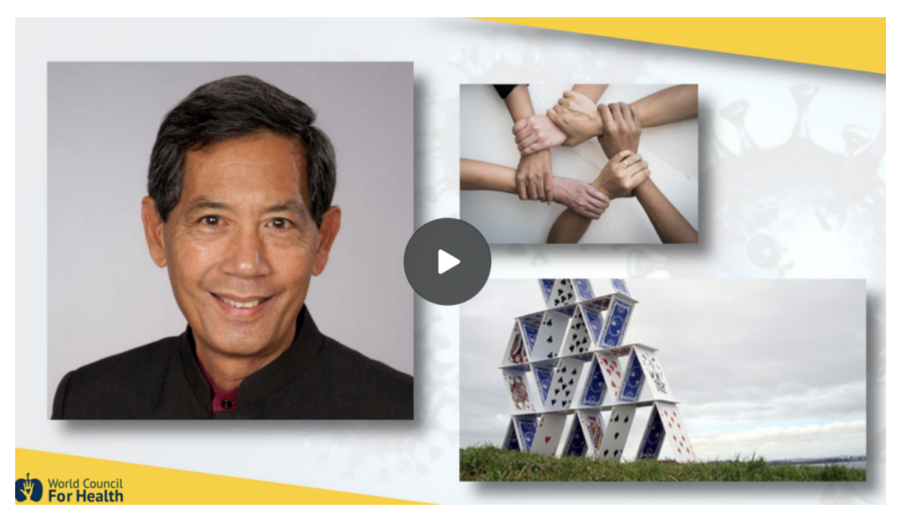
Click here to watch the video

The cards are all on the table. It is time for us to take action, turn the tables, and hunt the global preditors.