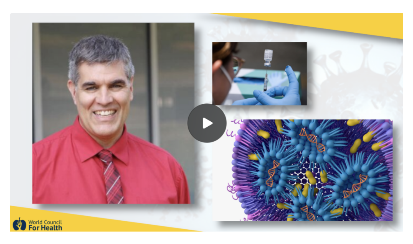
Click here to watch the video