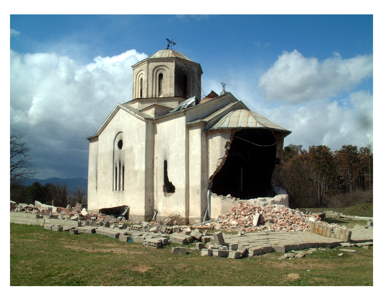
Serbian Orthodox church of St. Elijah in Podujevo destroyed in 2004 unrest by Kosovo Albanians (Licensed under CC BY 2.0)

However, the most terrible in the series of Kosovo Albanian eruptions of violence against the Serbs living in this region was organized and carried out between March 17th and 19th, 2004, having all the features of the organized pogrom.