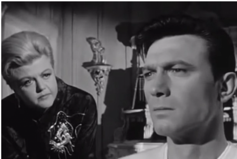
Angela Lansbury and Laurence Harvey in The Manchurian Candidate, in 1962. That movie, and the Richard Condon novel it was drawn from, imagined foreign attempts to direct the outcome of a U.S. presidential election. Yesterday the U.S. government said that Russian hackers have been deliberately trying to change the outcome of this year's race.