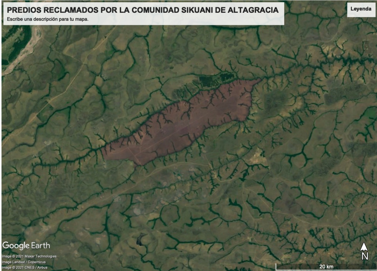
Altagracia (brown area) is the Guahibo ancestral territory. The green area bordering it to the north is land cultivated with oil palm. Image from Google Earth.