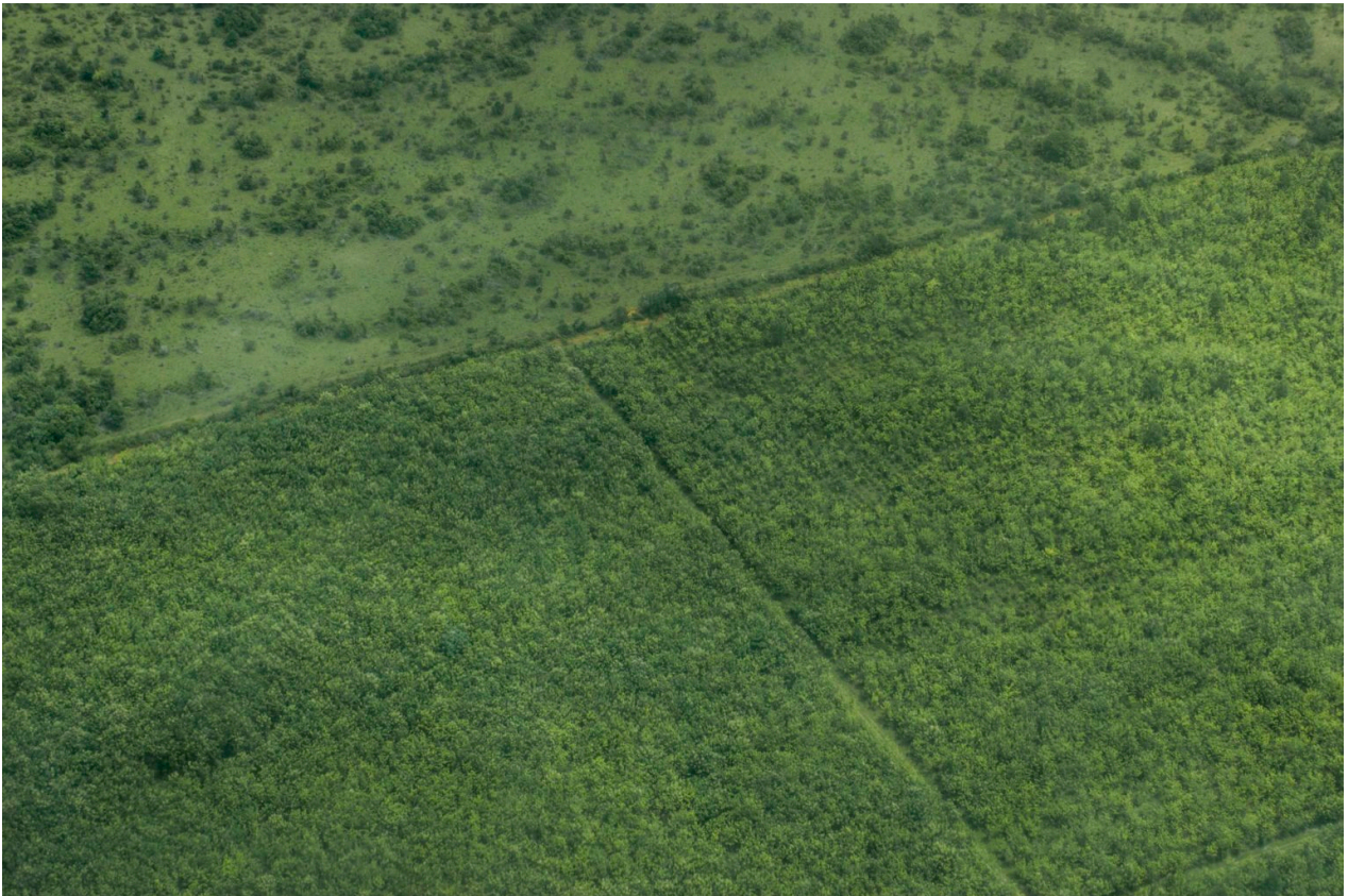
Aerial shot of the Agrícola El Encanto oil palm plantation.

Between 2005 and 2006, paramilitary groups in the area demobilized, giving way to the arrival of large agribusiness companies, a move promoted by the government of former president Álvaro Uribe Vélez.