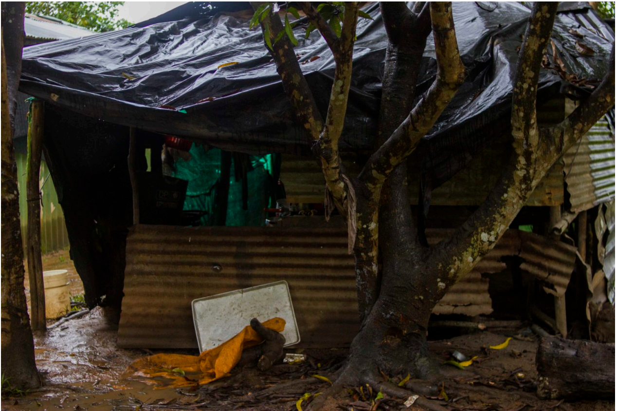
A typical dwelling in the El Trompillo community.

Department of Protection of Citizens' Rights; in their March 2021 report, the agency stated these groups include Autodefensas Gaitanistas de Colombia [Gaitanista Self-Defense Forces of Colombia] and the Puntilleros Libertadores del Vichada [Liberators of Vichada]. Alleged murders of land claimants in other parts of the eastern plains region of Colombia has also caused fear among Indigenous communities.