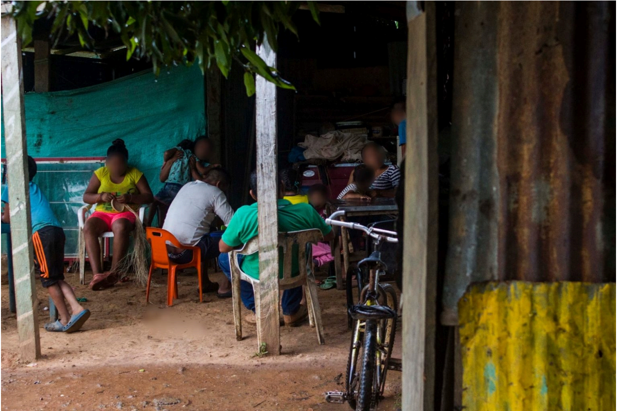
Afternoon in El Trompillo.

In 1989, Colombia signed Convention No. 169 of the International Labor Organization (ILO), which protects and recognizes the collective property of Indigenous peoples' ancestral territories.