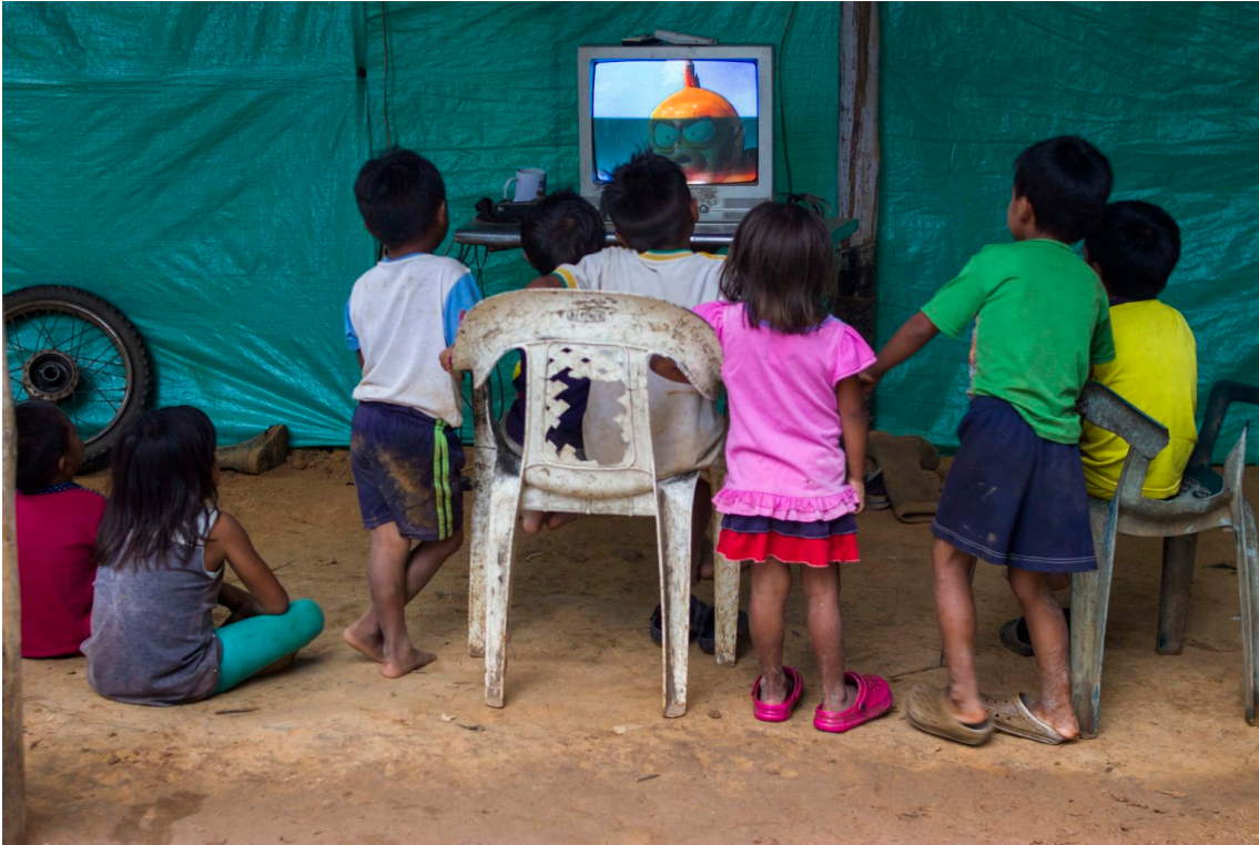
Indigenous children from the El Trompillo community.

In the mid-1990s, when the Guahibo community were still practicing a traditional semi-nomadic life, the 16th Front of the Revolutionary Armed Forces of Colombia (FARC) arrived in San Teodoro, a town neighboring Altagracia, quickly turning it into a key location for drug trafficking.