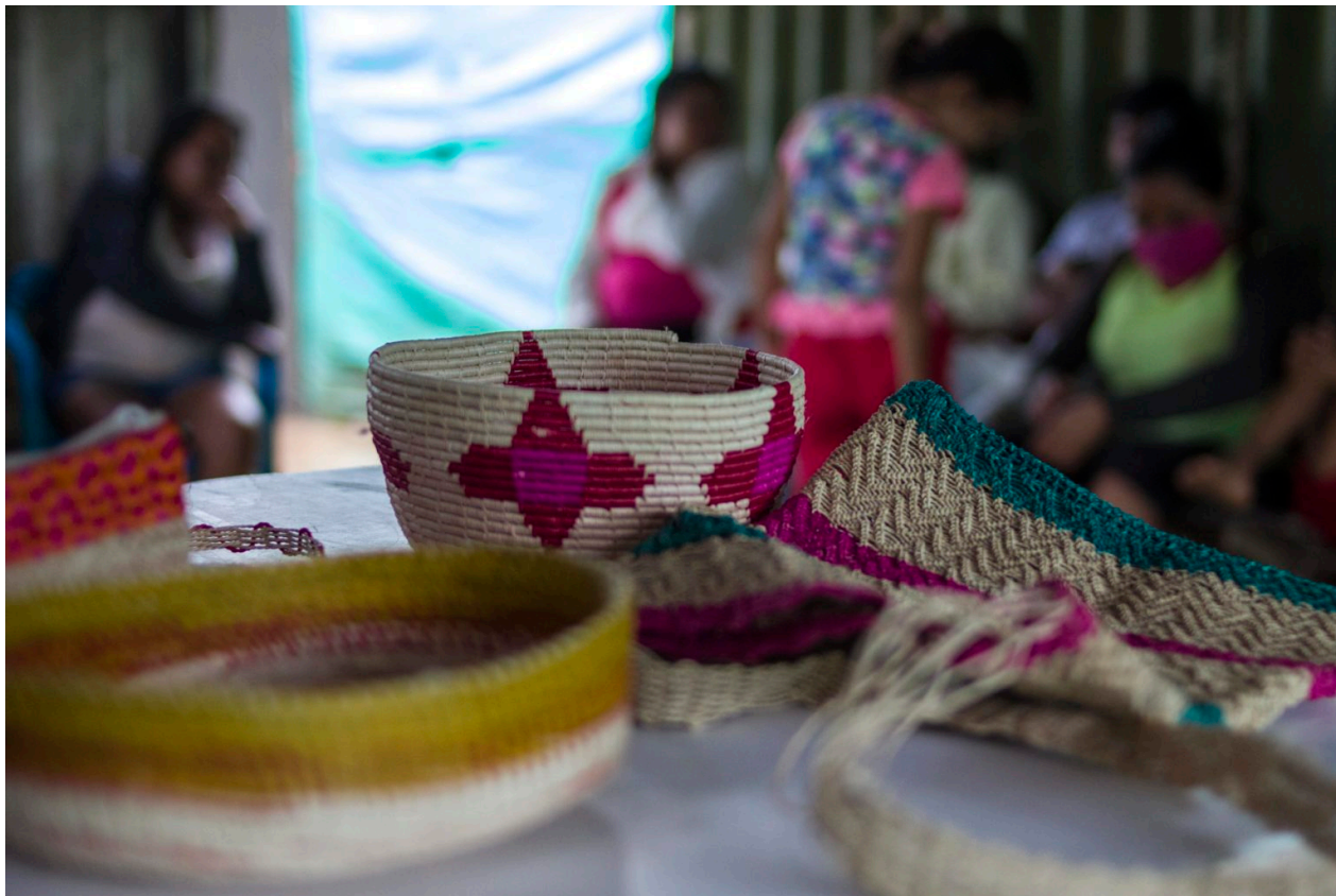
Crafts made by the weavers in the El Trompillo community.

Overcrowding and hunger is rife. The Guahibo of Altagracia survive on the little work community members can find in La Primavera and on the sale of woven goods. “Sometimes there’s work for one day, but it’s not permanent. We also sell what the women make, but it’s not enough to provide food every day,” one community member said.