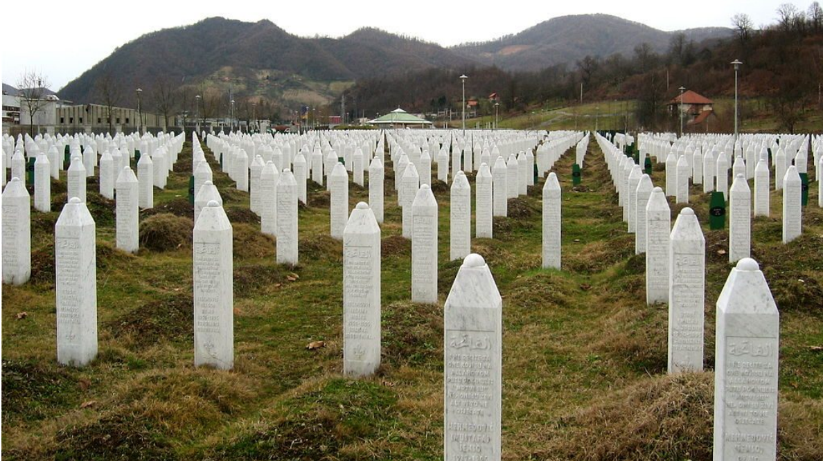
Gravestones at the Potočari genocide memorial near Srebrenica

sharp distinction, nicely elaborated by Josep Borrell, between the Garden and the Jungle. Even more to the point, where genocide is concerned, the distinction is between worthy and “unworthy” victims, as the late Prof. Edward Herman had insistently maintained.