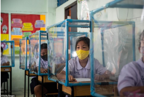
Social distancing has devastating consequences.

Economic and social decision-making is criminalized. The legitimacy of Wall Street, the World Economic Forum (WEF), Big Pharma and the billionaire foundations which ordered the closure of the global economy on March 11, 2020 must be forcefully addressed.