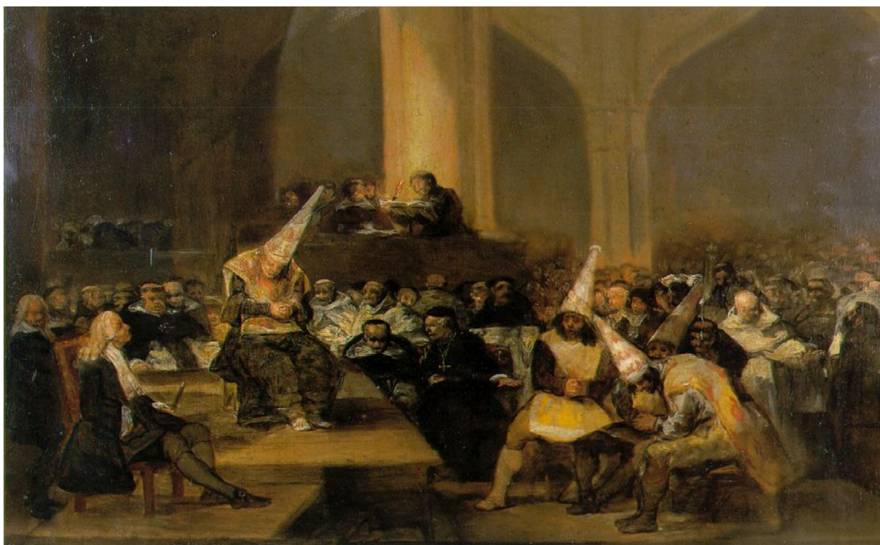
Francisco Goya: The Spanish Inquisition (1812-1819) Real Academia de Bellas Artes de San Fernando, Madrid