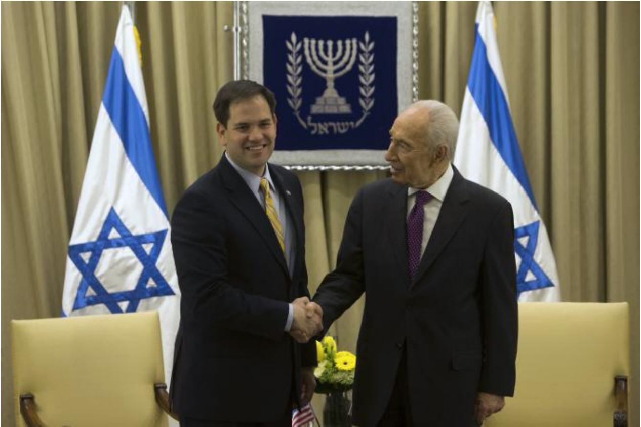
ON BOARD: Rubio with Israeli luminary Shimon Peres.