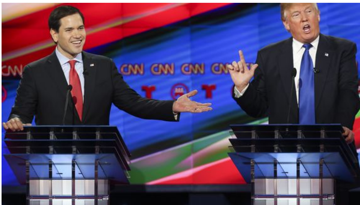
LITTLE MARCO: Trump's crude deconstruction of Rubio delivered the final blow.

Trump finally hit back with a moniker that Rubio could never shake, renaming him “ Little Marco. ”