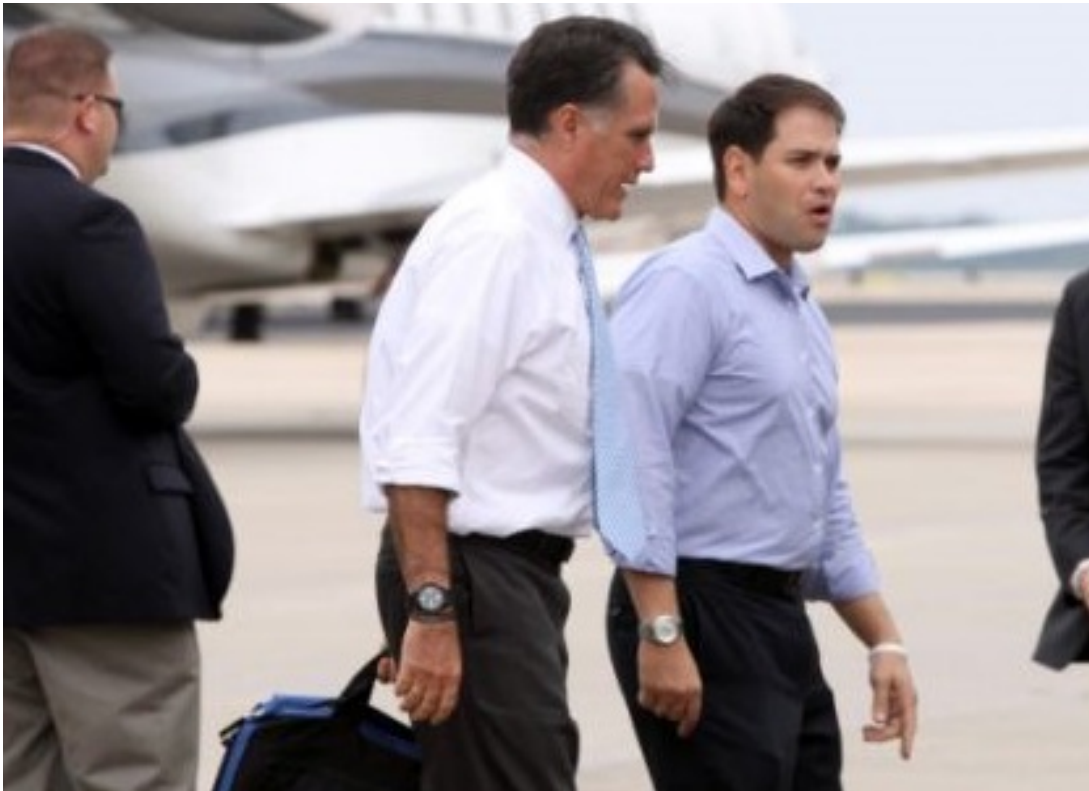
JET-SET: Rubio taking instructions from elite off-shoring corporate raider Mitt Romney.

delegate majority needed to secure the GOP nomination before the Republican National Convention in Cleveland Ohio this July.