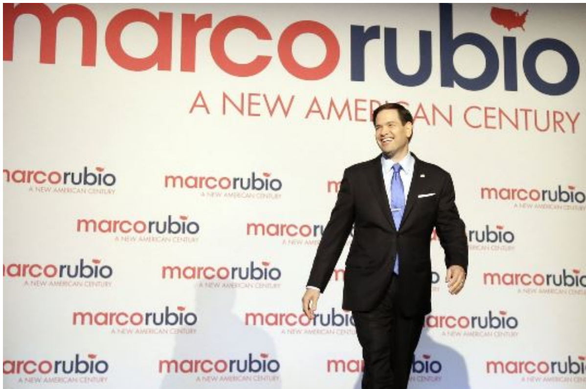
A NEW AMERICAN CENTURY: Rubio uses Neocon's PNAC and 'Israel-first' old marketing slogan.