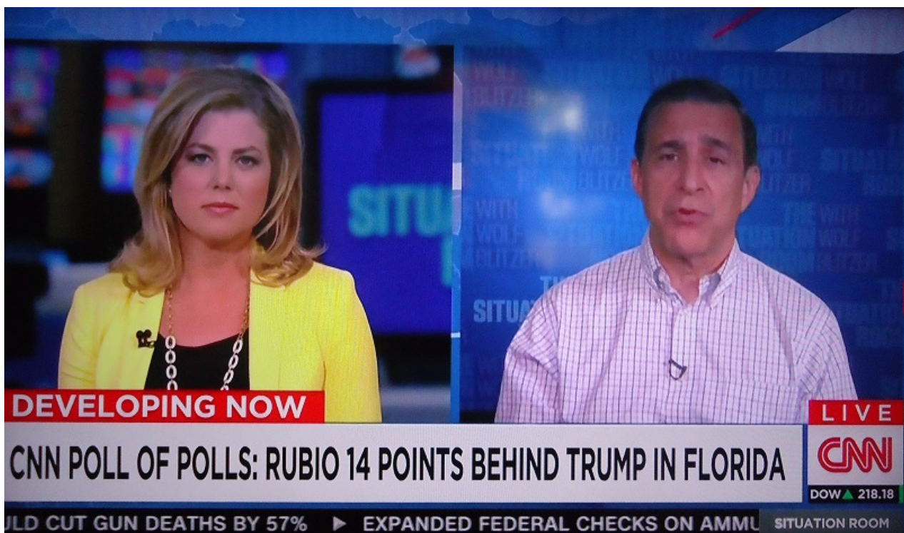
DETACHED: Darryl Issa throws himself under the bus,, desperate to inflate Rubio before Super Tuesday.

It’s important to remember that the establishment firmly believed, and still to this day, that Marco Rubio could be the Republican Party’s answer to the marketing sensation that was Barack Obama in 2008. By capitalizing on his youth and his Latino profile, the GOP elite saw this as a ‘turn-key’ marketing solution. Just like a soda pop brand, party and media operatives believed that by positioning Rubio’s brand in a highbrow market tier, voters would make the necessary connections and move to act by casting their vote for him.