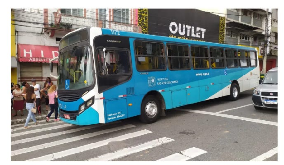
Bus driver suffers from sudden illness and dies while traveling in São José dos Campos, SP

A 50-year-old bus driver died after suffering a sudden illness during a late Monday morning trip (27) in São José dos Campos (SP).