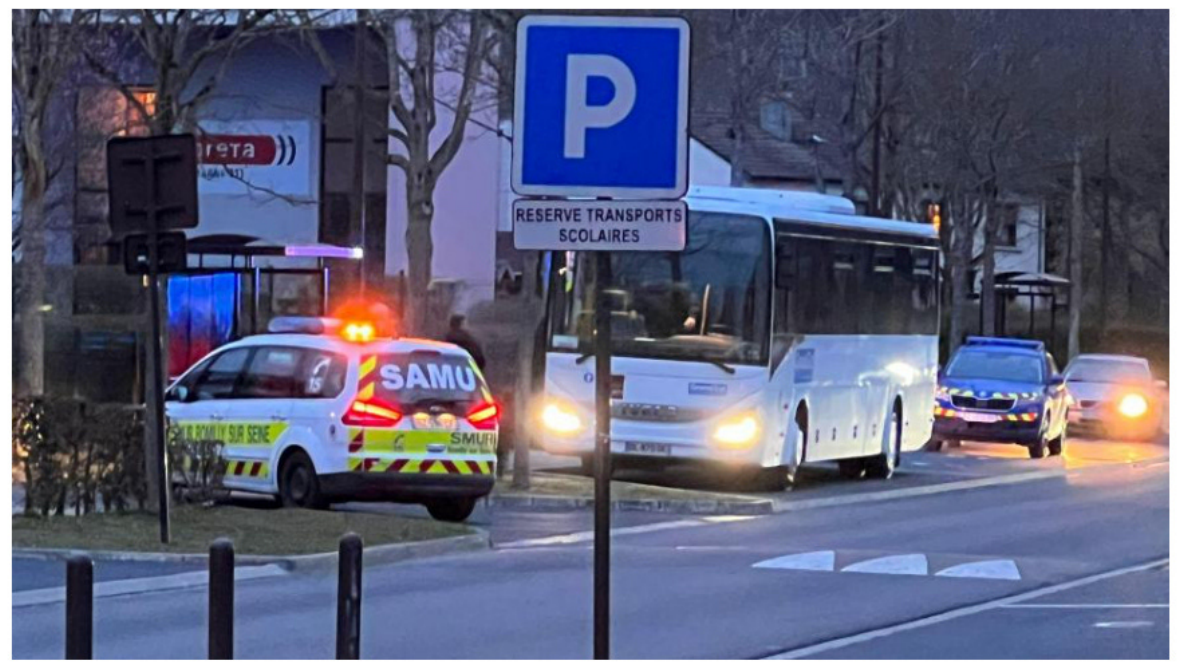
The driver was parked on the bus lanes in front of the school city of Sézanne. - Jérôme Lefèvre

A victim of heart discomfort, a bus driver died in front of the school city of Sézanne ( Marne ). The students on the bus were evacuated.