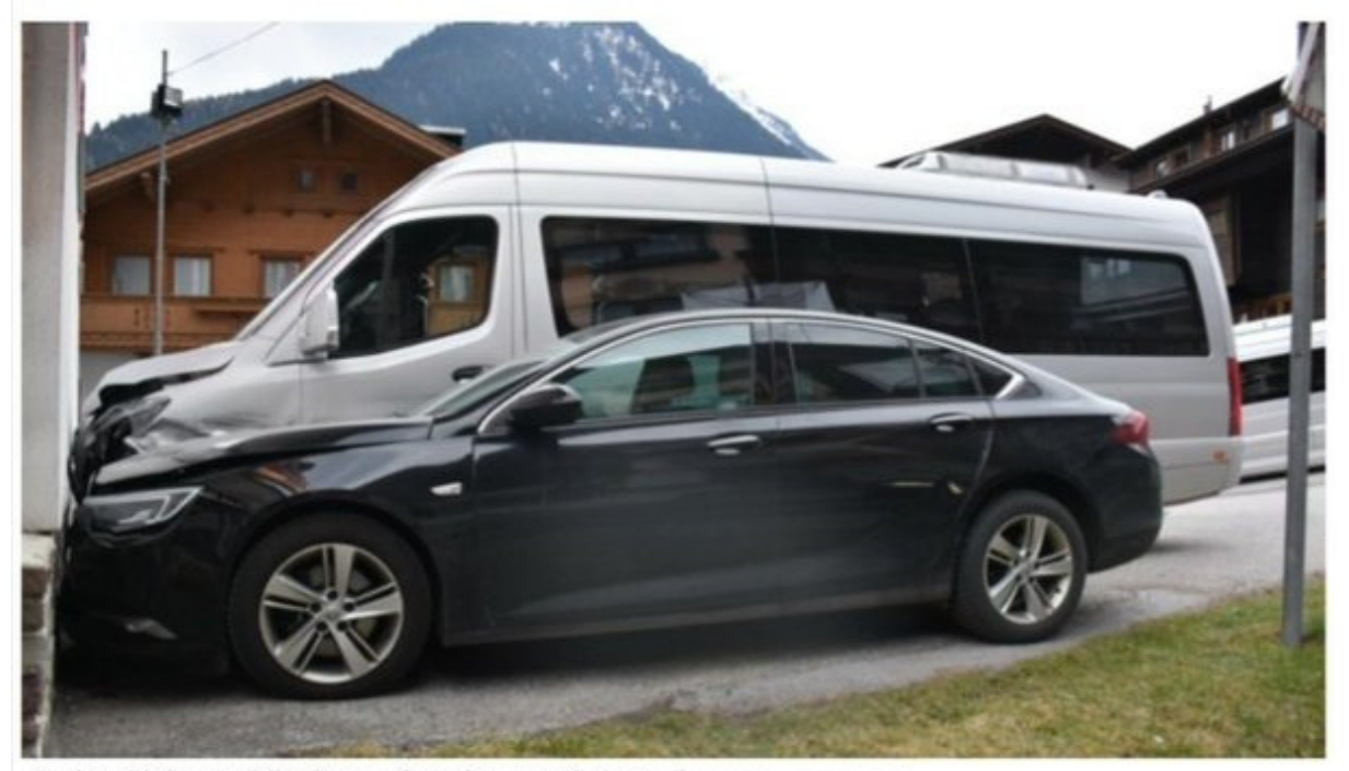
Both vehicles and the house facade were damaged.

The occupants of a bus in the Tyrolean Zillertal had to live through anxious moments late Sunday afternoon: Due to a medical emergency, the driver lost control of the vehicle and crashed into a parked car. The chauffeur was flown to the Innsbruck clinic with the emergency doctor helicopter. The passengers escaped with a fright.