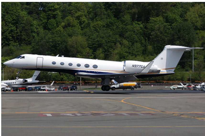
The black jet is actually white.

"We expect the Russian government to look at all options available to expel Mr Snowden back to the US to face justice for the crimes with which he is charged," a National Security Council spokeswoman told reporters. The US also urged countries in the "Western Hemisphere" not to let him in.