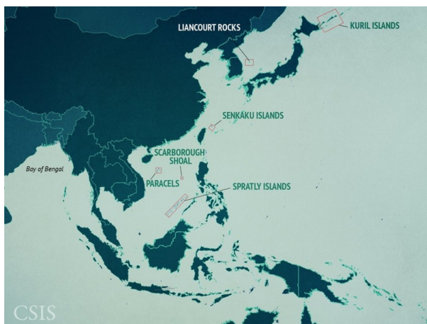
Map showing the location, within the South China Sea, of the Paracels, the Spratlys, and Scarborough Shoal

The Second Indochina War is not as significant, but it still means that for years US forces operated in some of the regions under dispute, following agreements with the Republic of Vietnam and other states in the region, including the Philippines. Although again not the purpose of this paper, any examination in depth of American policy concerning the territorial dispute over the South China Sea cannot ignore this episode. Instead, the diplomatic history of the period should be examined in the search for evidence of any event or document of legal significance.