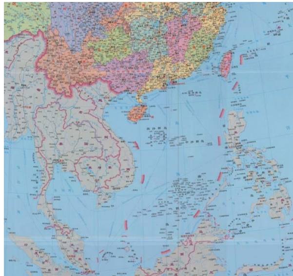
South China Sea map first published in January 2013 by China’s state mapping authority Sinomap Press, featuring 10 dashes instead of the previous nine

Third, the page devoted to “‘Historic’ Bays and Title”. The text stresses that “The burden of establishing the existence of a historic bay or historic title is on the claimant”, adding that the US position is that in order to do this the country in question must “demonstrate (1) open, notorious, and effective exercise of authority over the body of water in question; (2) continuous exercise of that authority; and (3) acquiescence by foreign States in the exercise of that authority”. 74 The text explains that this traditional American perspective is in line with the International Court of Justice 75 and “the 1962 study on the ‘Juridical Regime of Historic Waters, Including Historic Bays,’ commissioned by the Conference that adopted the 1958 Geneva Conventions on the law of the sea”. 76 It then turns its attention to the regulation of historic claims in Articles 10 and 15 of UNCLOS, 77 saying that they are “strictly limited geographically and substantively” and apply “only with respect to bays and similar near-shore coastal configurations, not in areas of EEZ, continental shelf, or high seas”. 78 Just like, when examining China’s posture we must take into account, as discussed later, the country’s history, and in particular the Opium Wars and their aftermath, American history has also shaped Washington’s perceptions and principles. The Barbary Wars 79 were widely seen as laying down fundamental principles of national policy such as rejection of blackmail,