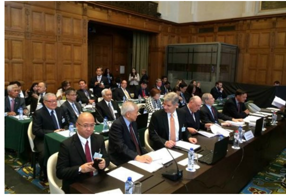
View of the Philippines' delegation at the Peace Palace, in The Hague (the Netherlands)