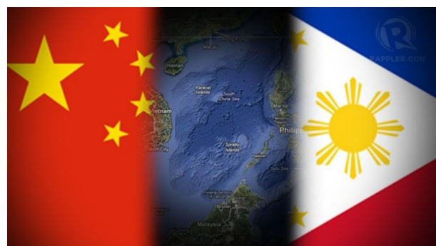
The Spratly Islands, a bone of contention between China and the Philippines

Concerning whether, if China "Made a Historic Claim", it would "have Validity", the DOS paper insists that "such a claim would be contrary to international law." The text does not stop at arguing that it is not open to a state to make historic claims based not on UNCLOS but on general international law, laying down a second line of defense. It explains that, "even assuming that a Chinese historic claim in the South China Sea were governed by 'general international law' rather than the Convention", it would still be invalid since it would not meet the necessary requirements under general international law, namely "open, notorious, and effective exercise of authority over the South China Sea", plus "continuous exercise of authority" in those waters and "acquiescence by foreign States" in such exercise of authority. Furthermore, it explains that the United States, which "is active in protesting historic claims around the world that it deems excessive", has not protested "the dashed line on these grounds, because it does not believe that such a claim has been made by China", with Washington choosing instead to request a clarification of the claim. Whether this view is also meant to avoid a frontal clash with Beijing, in line with the often state policy goal of "managing" rather than "containing" China's rise, is something not discussed in the text.