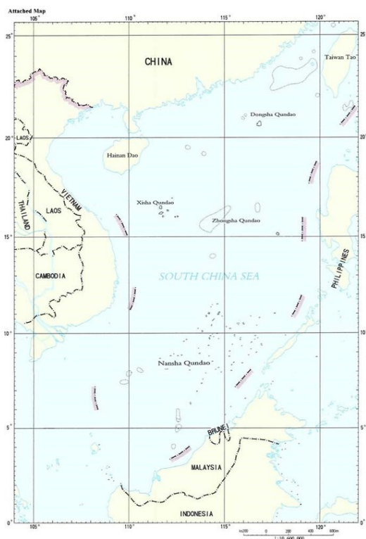
Nine-dash map attached to China’s two 2009 Notes Verbales