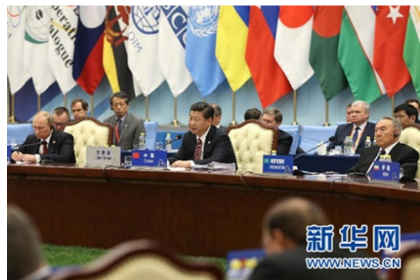
CICA 2014 plenary with Vladimir Putin (left) and Xi Jinping (center).

What President Park probably most wanted to hear from Xi was a strong commitment to pressing North Korea on nuclear weapons and ballistic missiles as a condition of resumption of diplomatic engagement. As is by now well known, discussion in Beijing has turned from consistent support of Pyongyang on the nuclear issue to concern about how Pyongyang's behavior might hurt PRC interests. But China's public position had already been established when Xi Jinping spoke in May to the 24-member Conference on Interaction and Confidence Building in Asia (CICA), a four year old Chinese diplomatic initiative. 9 That group embraces most Asian as well as Middle East countries.