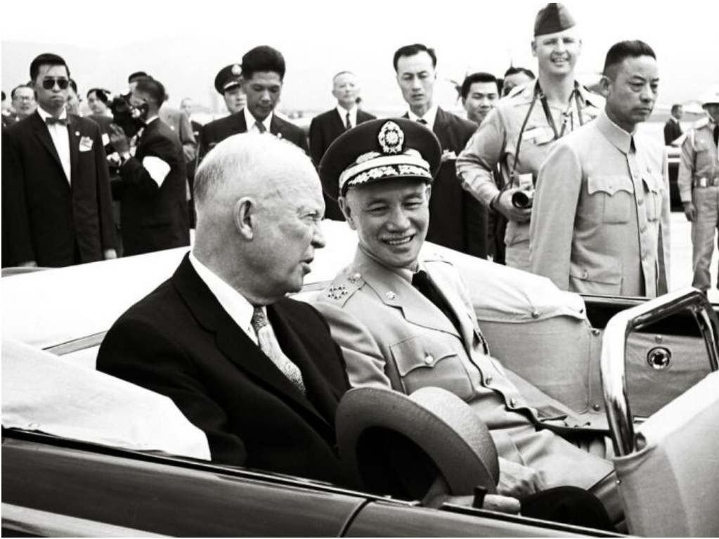
Dwight Eisenhower rides in a motorcade with Chiang Kai-Shek in Taiwan in the early 1950s.

The United States had lost China to the Chinese—the wrong Chinese. The U.S. then threatened the use of nuclear weapons against China.