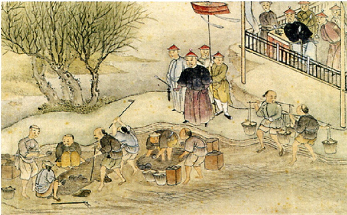
Depiction of Commissioner Lin Zexu presiding over ceremony dumping British-traffic opium at sea.