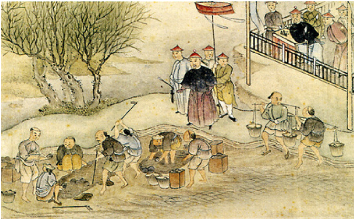
Depiction of Commissioner Lin Zexu presiding over ceremony dumping British-trafficked opium at sea.

Though Boston merchants came to control only ten percent of the opium trade in China, they were vastly enriched and some of the profits financed the early industrial revolution in America, as well as the physical development of Boston itself and institutions like Harvard University. Many aristocratic figures known as “Boston Brahmins” owed their fortunes to opium, among them the grandfather of President Franklin Roosevelt, Warren Delano.