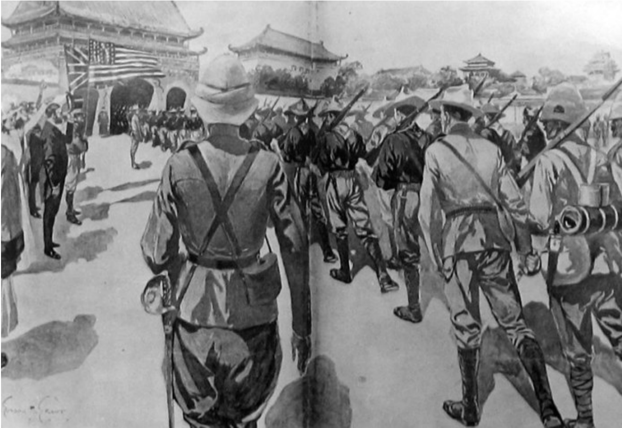
U.S. troops in China during the Boxer Rebellion.

The escalating rivalry of Europeans in Europe itself led to all-out war in 1914 and this induced all powers except Japan to withdraw from China. The U.S. financed the Allies and avoided entry into World War I until the last year when it became clear that the debts owed by Britain, France and Russia would never be paid unless American military forces tipped the balance on the battlefield.