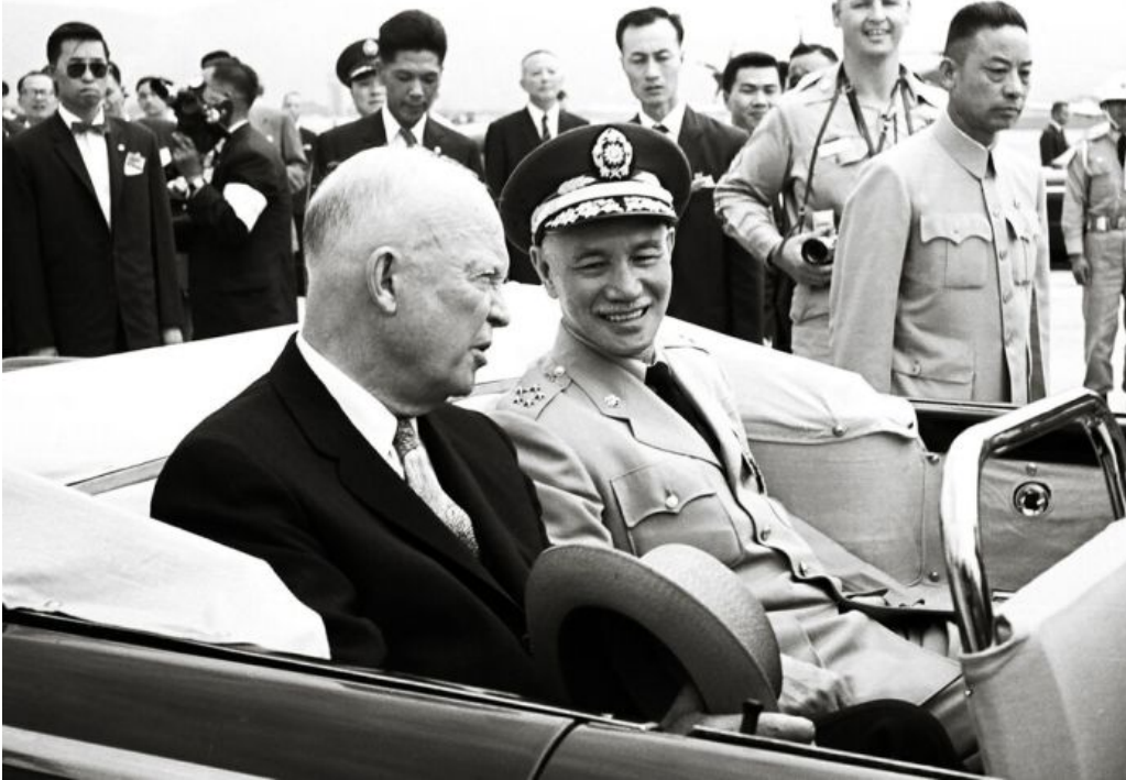
Dwight Eisenhower rides in a motorcade with Chiang Kai-Shek in Taiwan in the early 1950s.

The United States had lost China to the Chinese—the wrong Chinese. The U.S. then threatened the use of nuclear weapons against China.