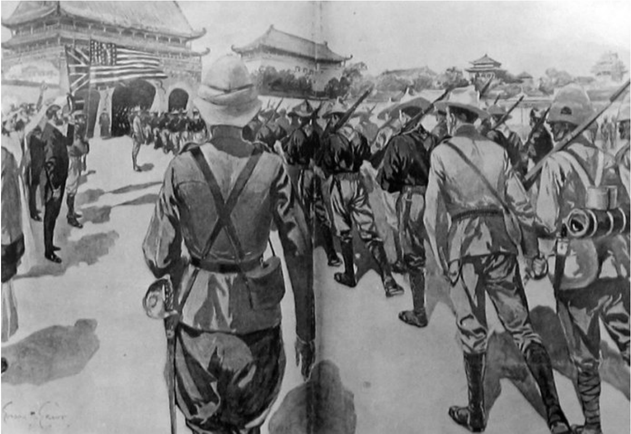
U.S. troops in China during the Boxer Rebellion.

The escalating rivalry of Europeans in Europe itself led to all-out war in 1914 and this induced all powers except Japan to withdraw from China. The U.S. financed the Allies and avoided entry into World War I until the last year when it became clear that the debts owed by Britain, France and Russia would never be paid unless American military forces tipped the balance on the battlefield.