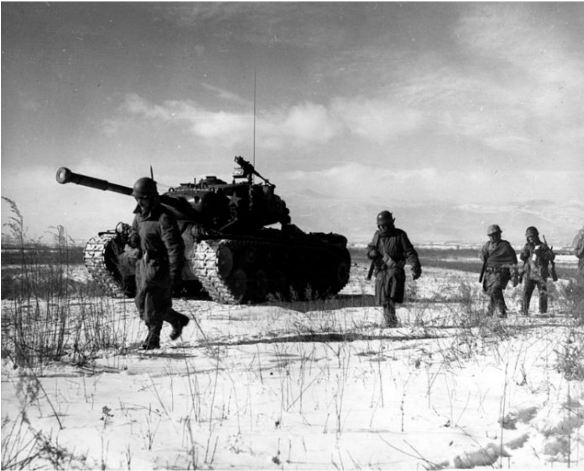
U.S. forces in North Korea during the Korean War.

with heavy losses, creating a real possibility of a devastating American rout. Secretary of State Dean Acheson frankly stated that “the defeat of U.S. forces in Korea in December (1950) was an incalculable defeat to U.S. foreign policy.”