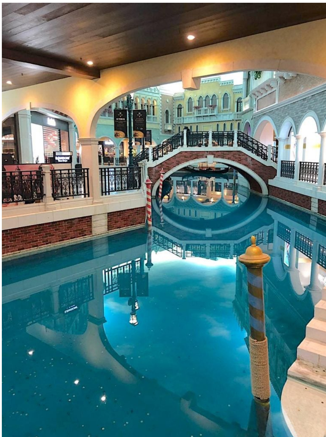
Fake canals inside Venetian Macau

'neutral' 0 (zero), giving a gambler very fair chance. But electronic, futuristic machines are a sham, and can 'strip' an unseasoned gambler of everything, in just a few hours, even minutes. But that is, obviously, precisely the goal.