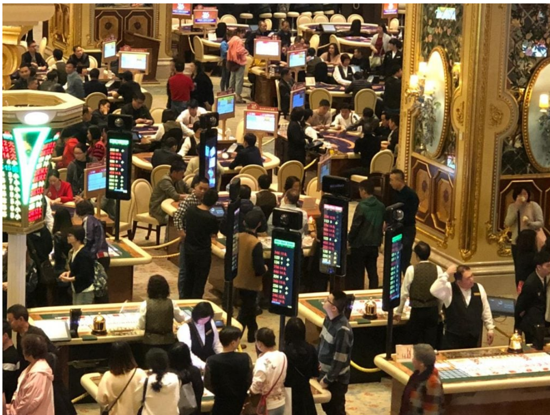
Biggest casino in the world – Venetian Macau

You want Venetian ; a tremendous mind-blowing temple of bad taste, complete with a fake San Marco Square, canals, gondolas (gondoliers don't sing O Sole Mio , thank God, as they are mostly from Portugal) and overcooked pasta – it is all here; one of the largest buildings on earth, and the biggest casino in the universe!