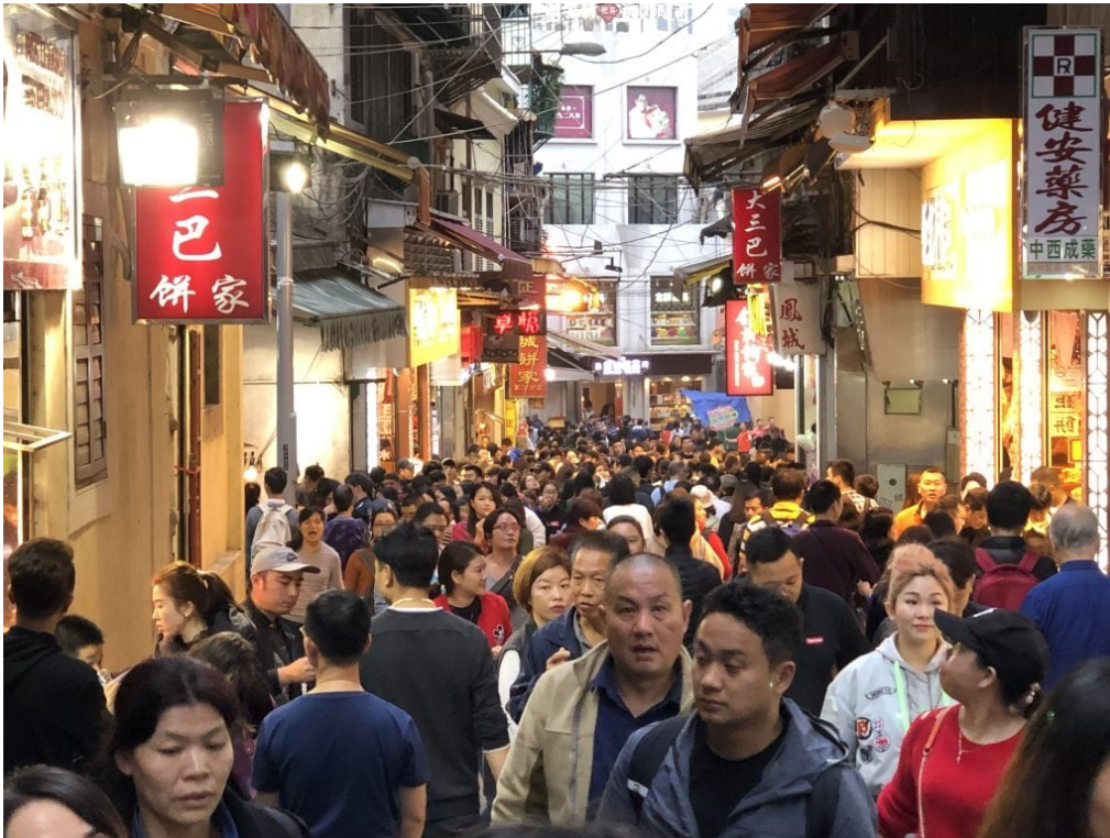
In historic Macau pedestrian traffic jams

more North American than North Americans themselves, ambitious and unscrupulous. Many of them speak about Mainland China sarcastically, with spite. Typical Western 'democracy' and 'freedom of speech' nonsense.