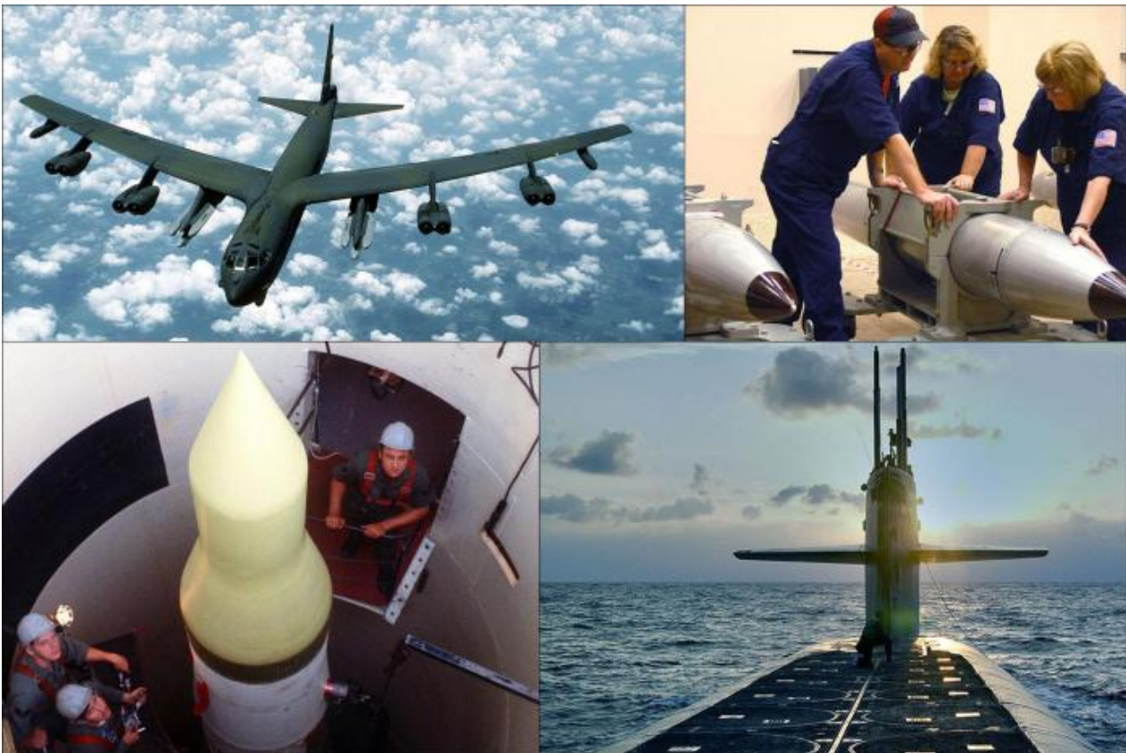
U.S. nukes

Besides specifying his intent on preparing U.S. forces to wage nuclear war, Cotton used his confirmation hearing to make a pitch for an even bigger budget for the U.S. nuclear arsenal—when the U.S. government is already slated to spend $634 billion over the 2021-2030 period , for an average of $60 billion per year , according to the Congressional Budget Office.