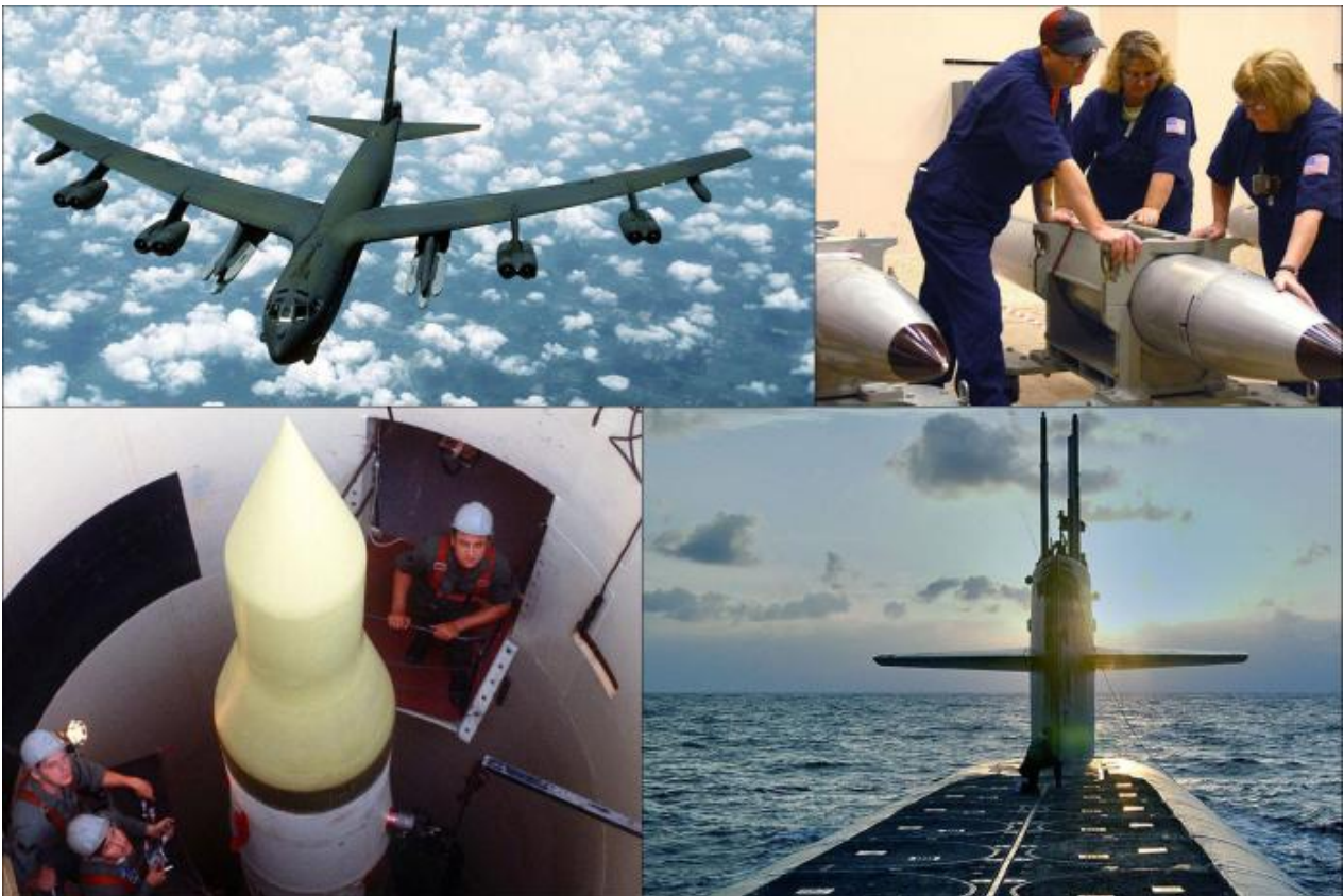
U.S. nukes

Besides specifying his intent on preparing U.S. forces to wage nuclear war, Cotton used his confirmation hearing to make a pitch for an even bigger budget for the U.S. nuclear arsenal—when the U.S. government is already slated to spend $634 billion over the 2021-2030 period , for an average of $60 billion per year , according to the Congressional Budget Office.